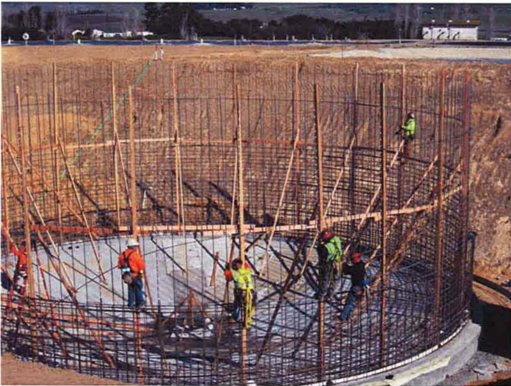
Tying wall reinforcing for Clarifier # 1.