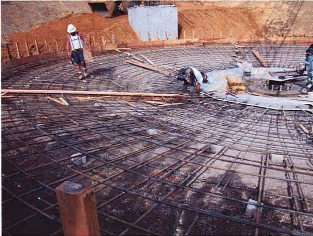
Cushman installing forms for slab construction joints with waterstop at Clarifier #2.