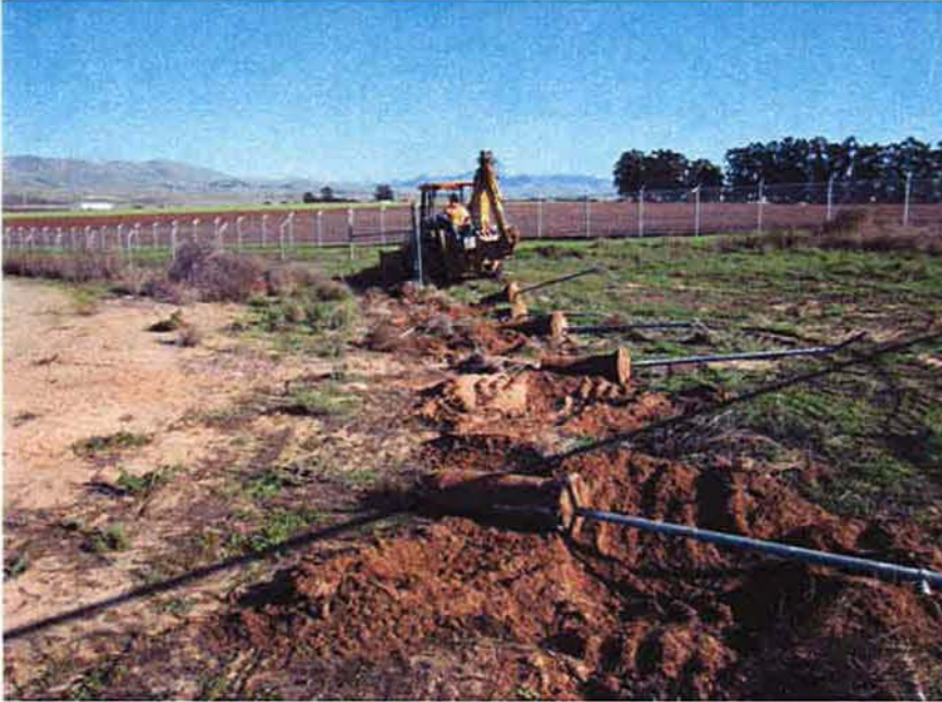
Removing existing chain link fencing.