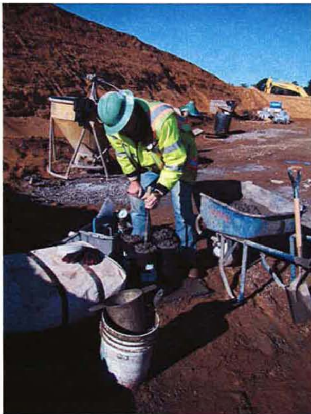
Making concrete test cylinders.