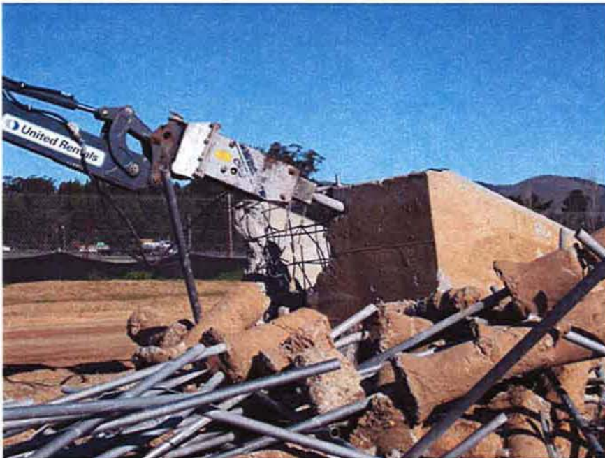
Breaking up concrete debris for disposal.