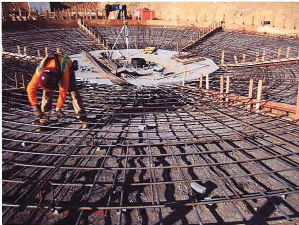
CMC Steel tying reinforcing for the slab at Clarifier #2.