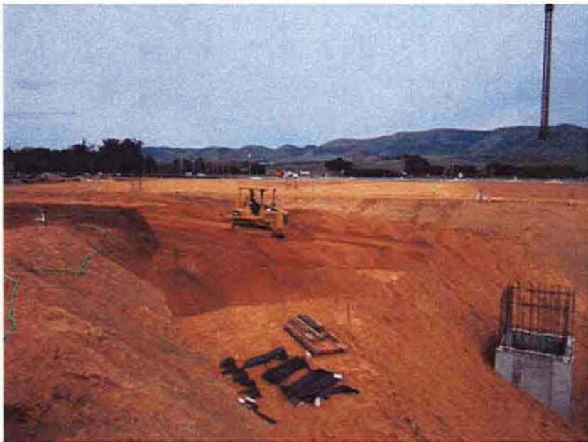
Backfilling and compaction of native base material at Electrical/Blower Building.