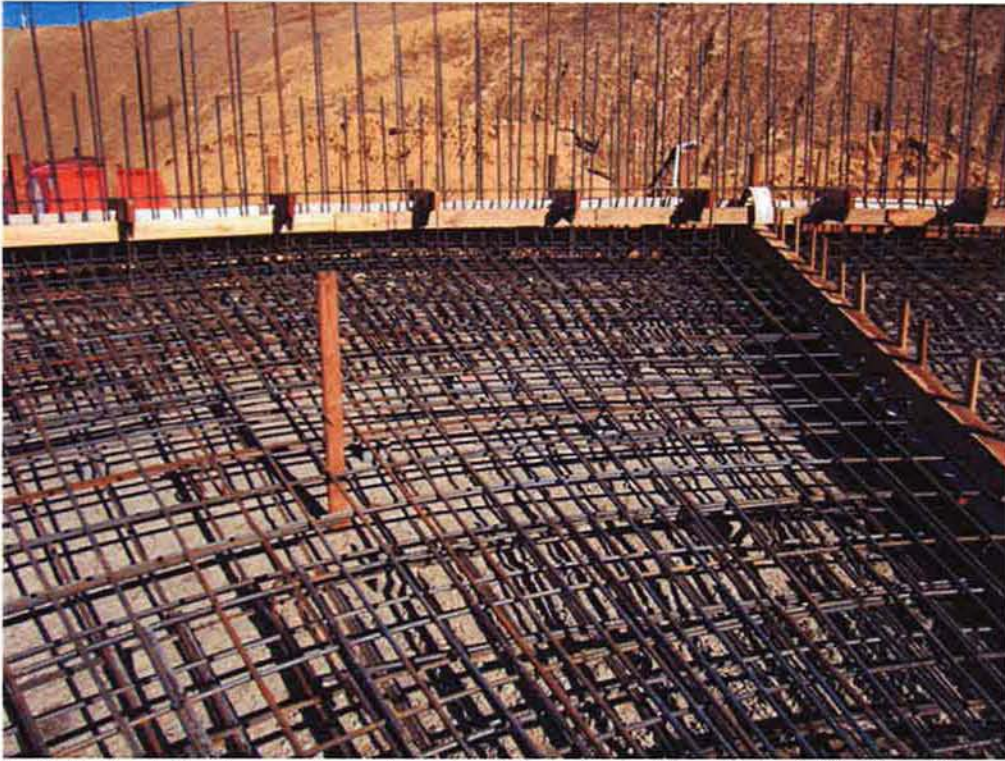
Installed reinforcing and construction joints in clarifier slab at Clarifier #2.