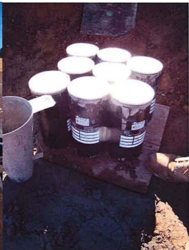
Final test cylinders waiting for pick-up.