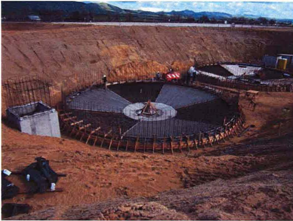
Three sections of the slabs at each clarifier being finished and curing.