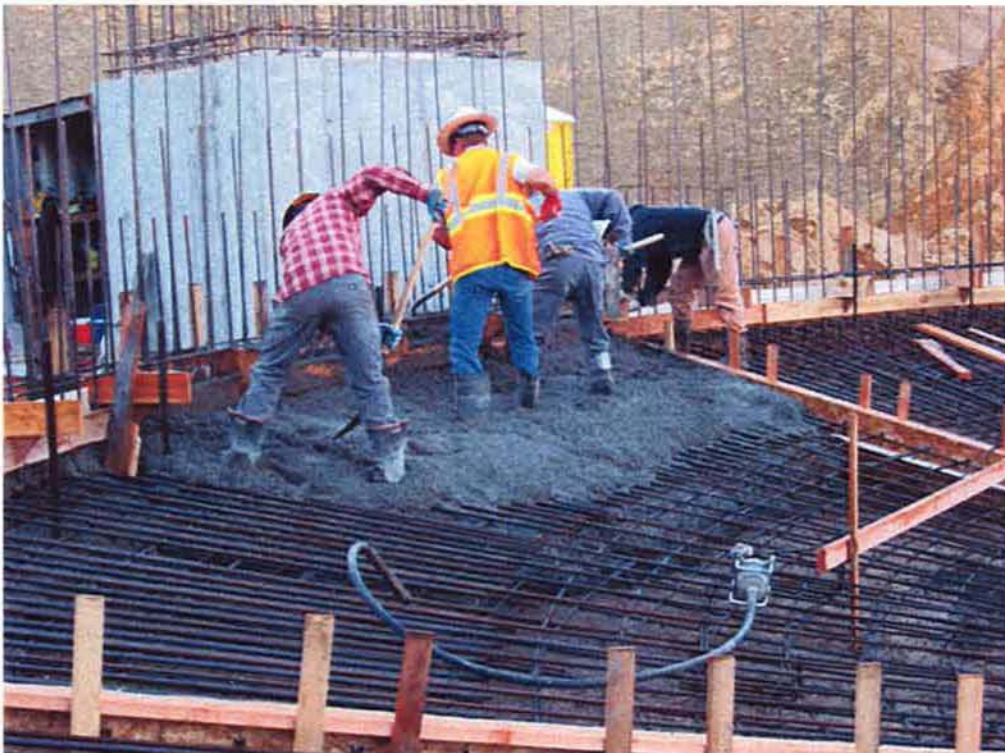
Cushman placing 4000 psi concrete in three sections of clarifier slabs at Clarifier #2.