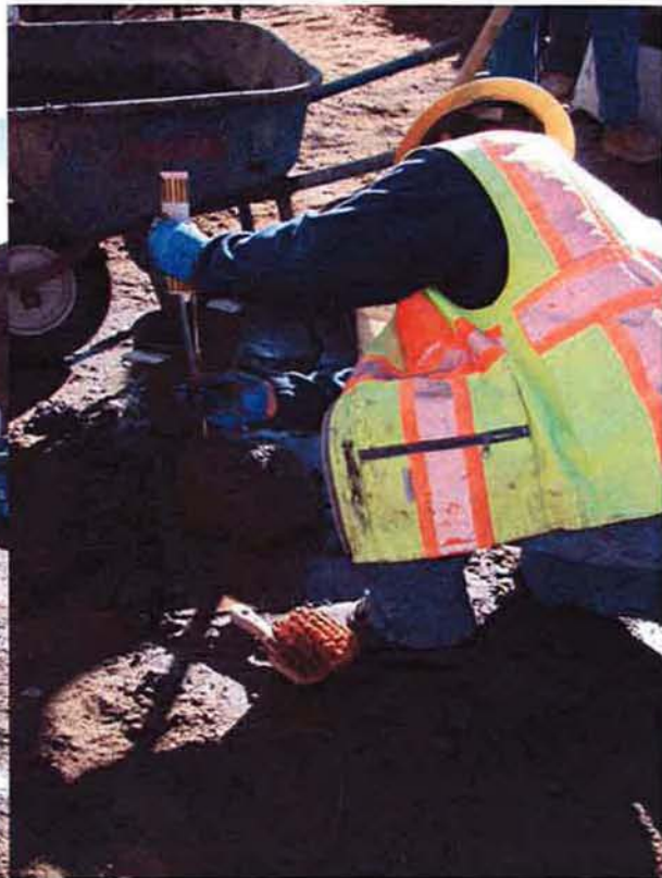
Measuring slumped concrete.