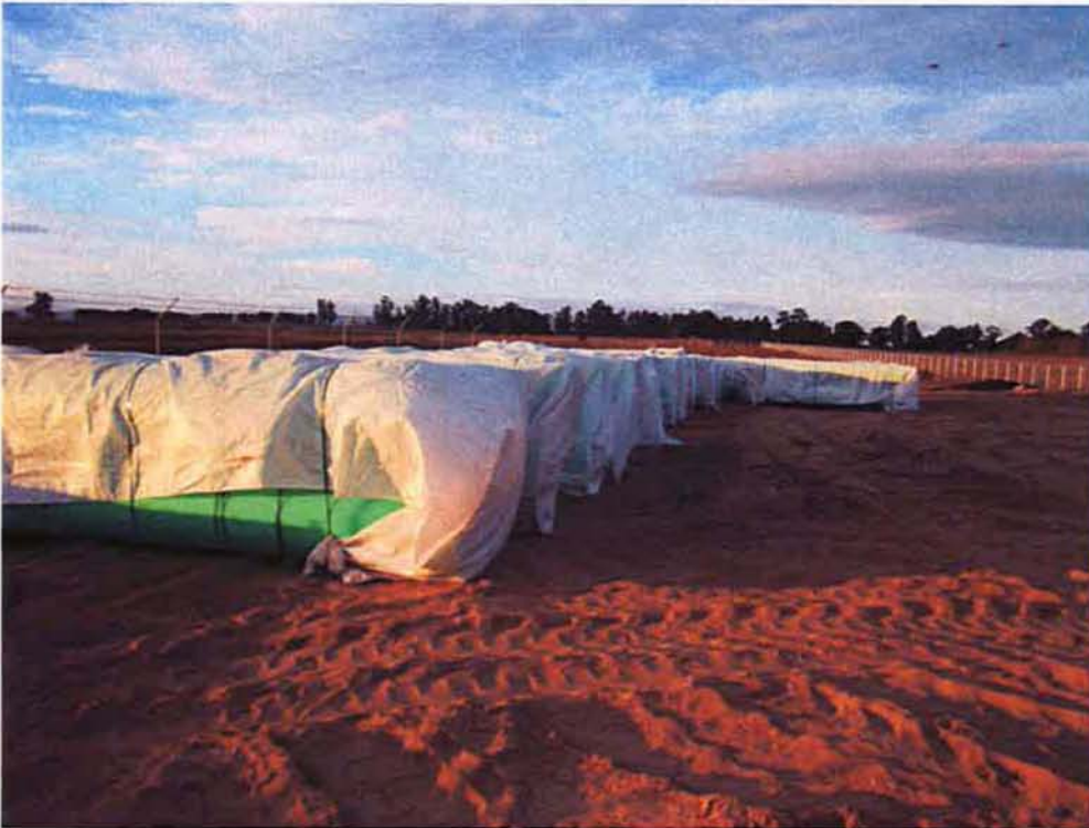
PVC pipe stored at site and covered for UV protection.