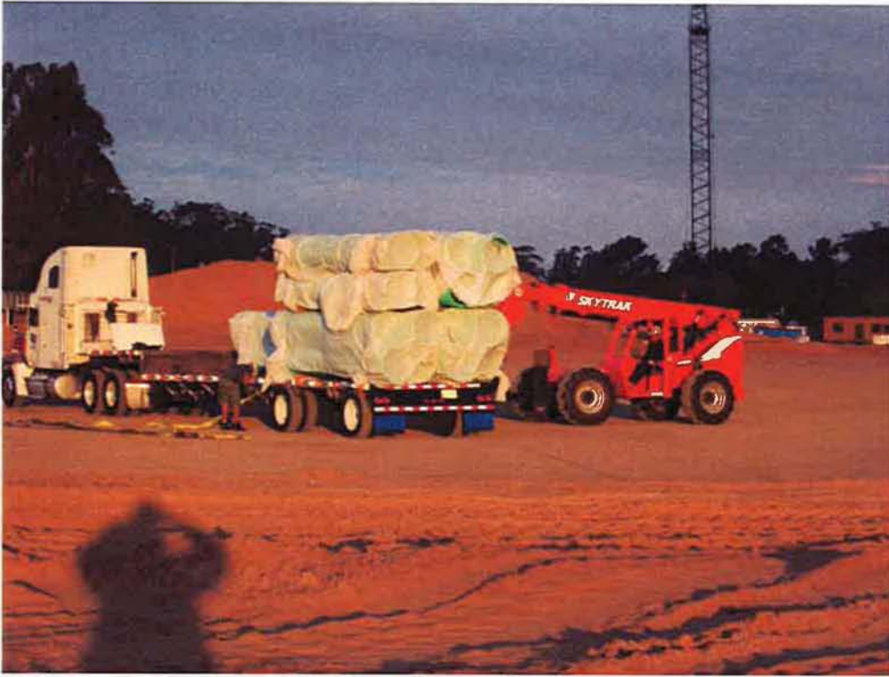
PVC pipe being delivered and unloaded.