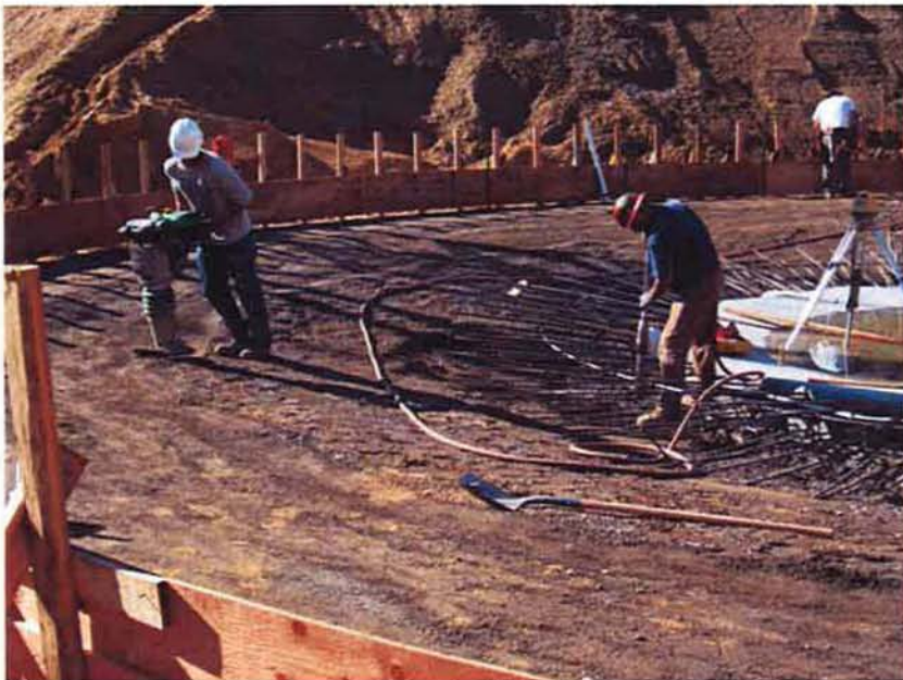
Compacting base material at Clarifier #2.