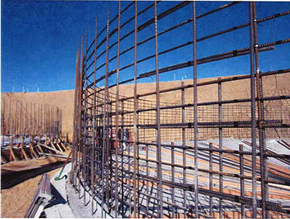
Base of wall reinforcing installed for Clarifier #1.