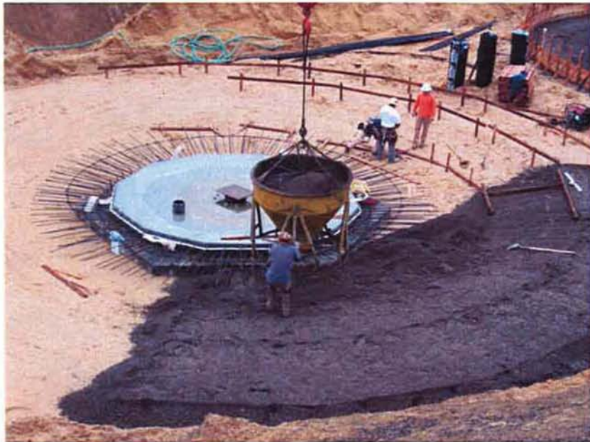
Placing base material at Clarifier #2.