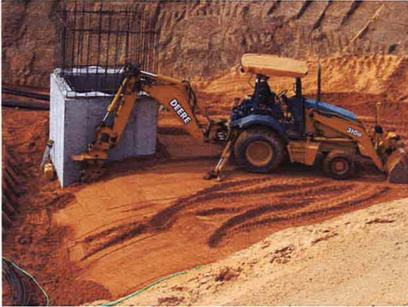
Backfilling and compacting around RAS/WAS Pump Station # 2 to bring base up for future Electrical/Blower Building.