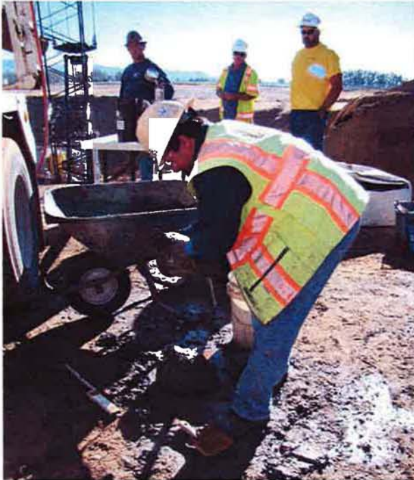
Fugro testing concrete, removing slump cone.