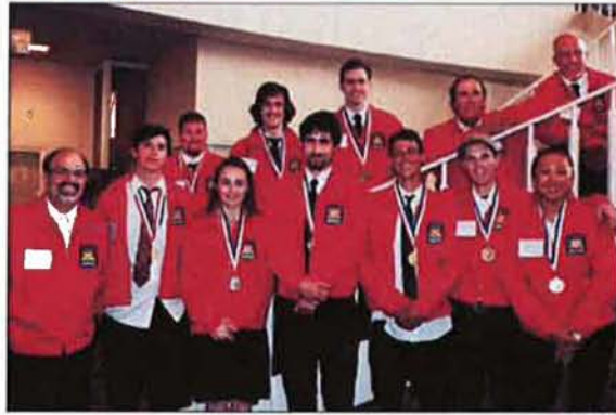
Career technical education students studying at Cuesta College earned 10 medals during the California Leadership and Skills competition held earlier this month in San Diego.