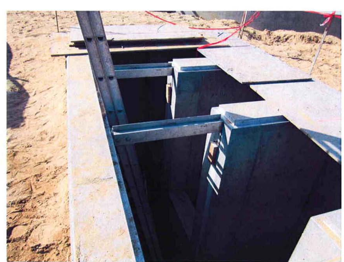
Installing beams for grating support at Distribution Box #2.