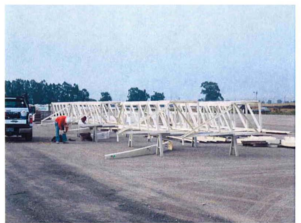
Cushman assembling clarifier mechanisms in preparation for installation inside clarifiers.