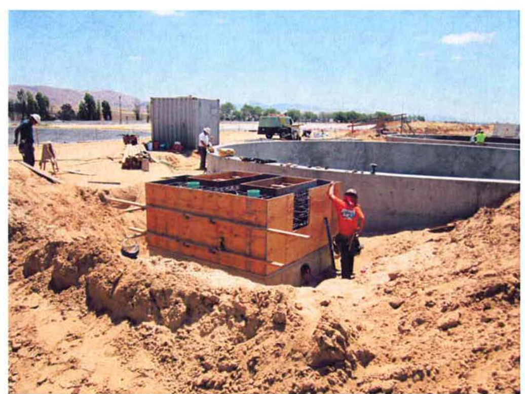
Forming the top of RAS/WAS Pump Station #2.