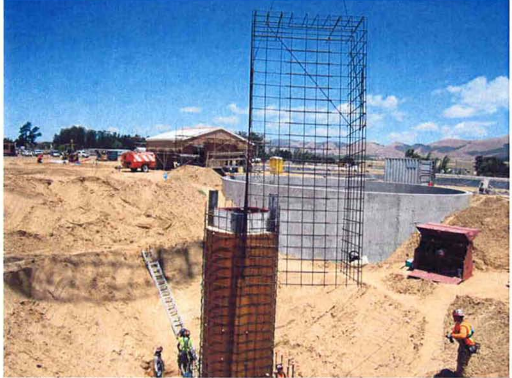
Installing reinforcing for the walls at the Scum Well.