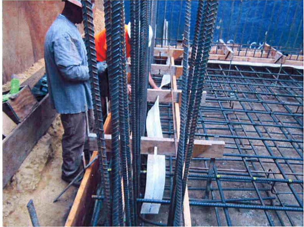
Installing water stop at base of wall and slab.