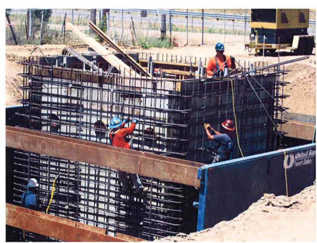
Installing rebar for walls.