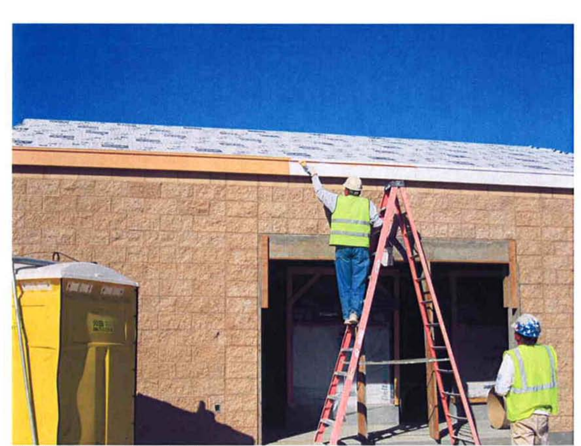
KNK Coating painting fascia.