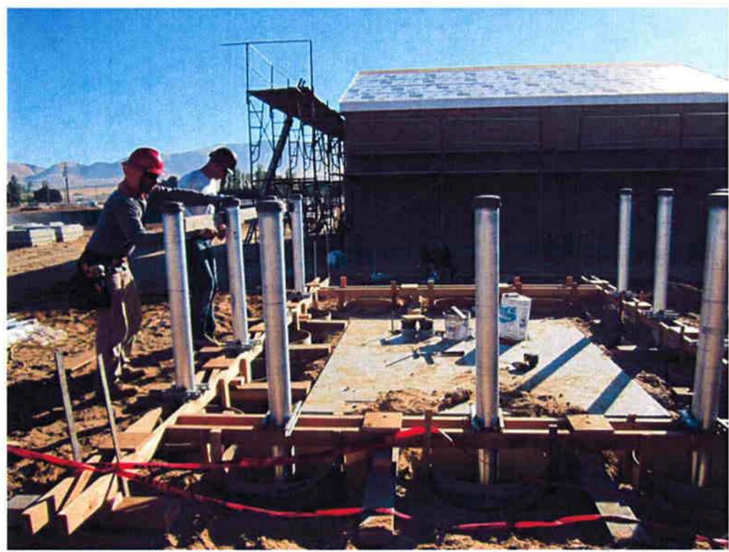
Cushman installing bollards around transformer pad in preparation for PG&E installing the transformer.