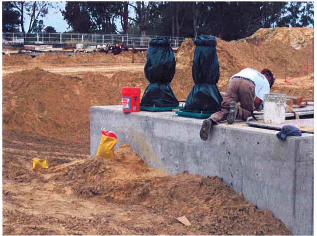
Cushman dry packing the mounting plates for the vertical turbine pumps at the Process Water Pump Station.