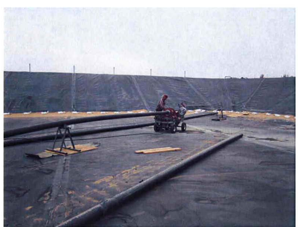
Cushman heat welding HDPE pipe for biofusers.