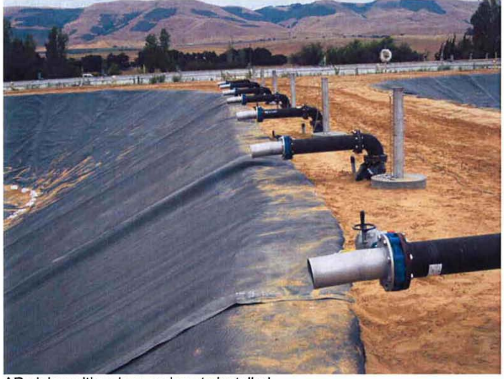
AR piping with valves and posts installed.