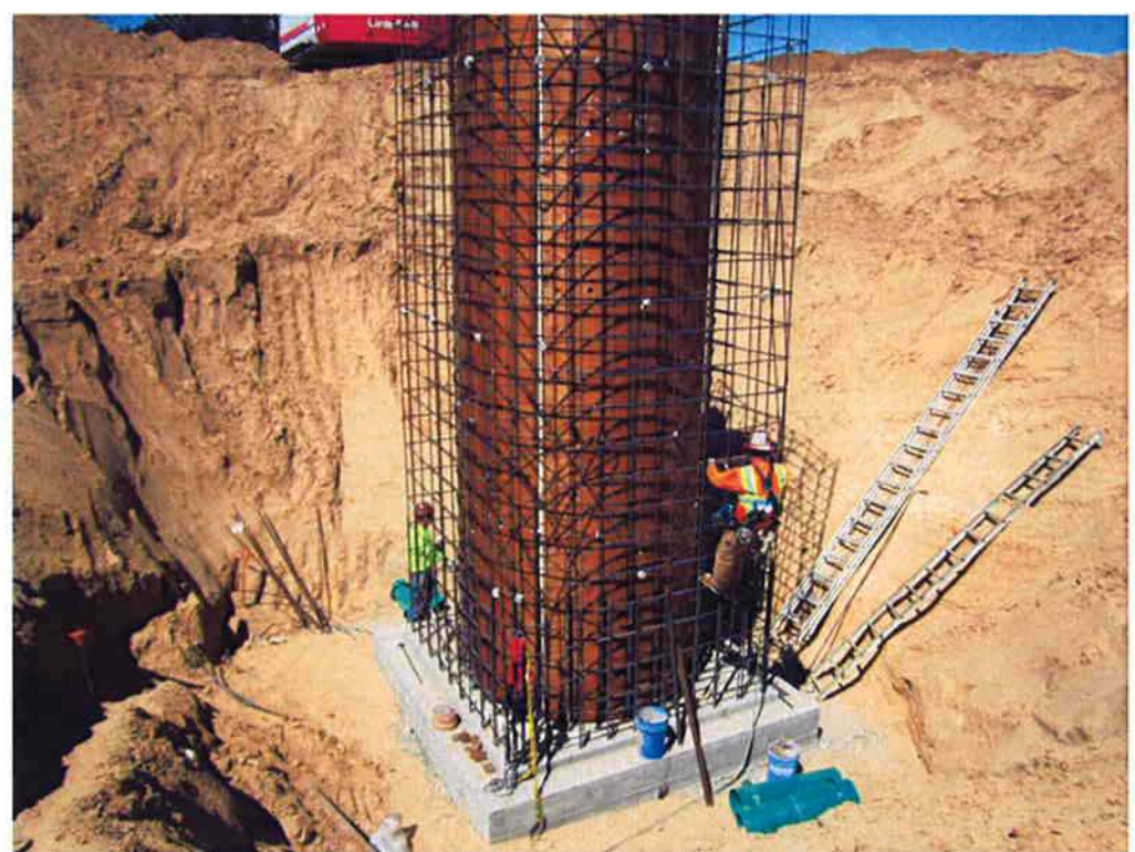
Tying reinforcing for the walls at the Scum Well.