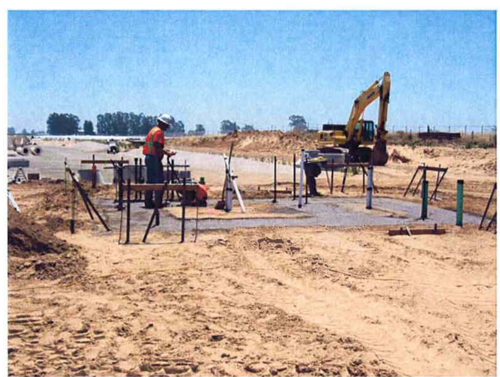
Compacting the base for the footings of the Sodium Hypochlorite Storage building.