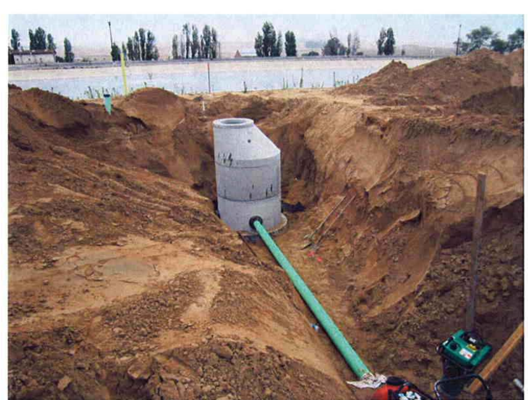
Manhole #6 installed with 6" DR piping to Manhole #7.