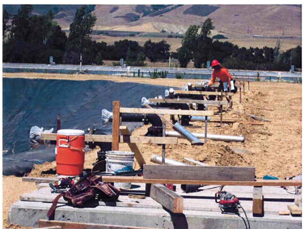
Installing anchor posts for the biofusers.