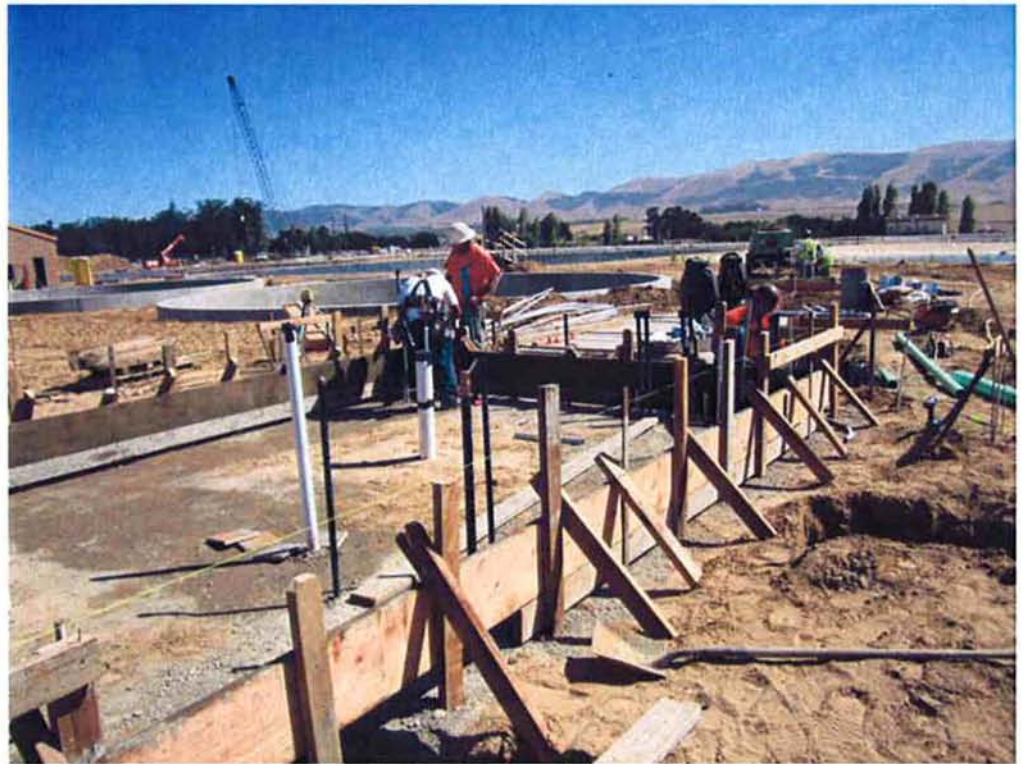
Cushman preparing forms for the Sodium Hypochlorite Storage building foundation.