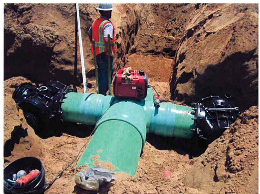
Cushman installing a tee on the 24" SE2 pipe.