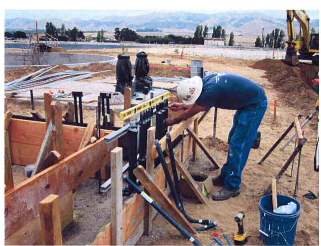
Bergelectric installing conduit through the footings of the Sodium Hypochlorite Storage building.