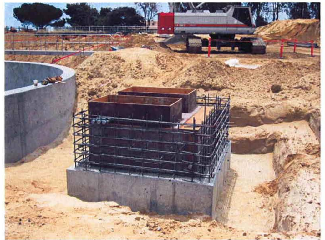
Forming the top of RAS/WAS Pump Station #2.