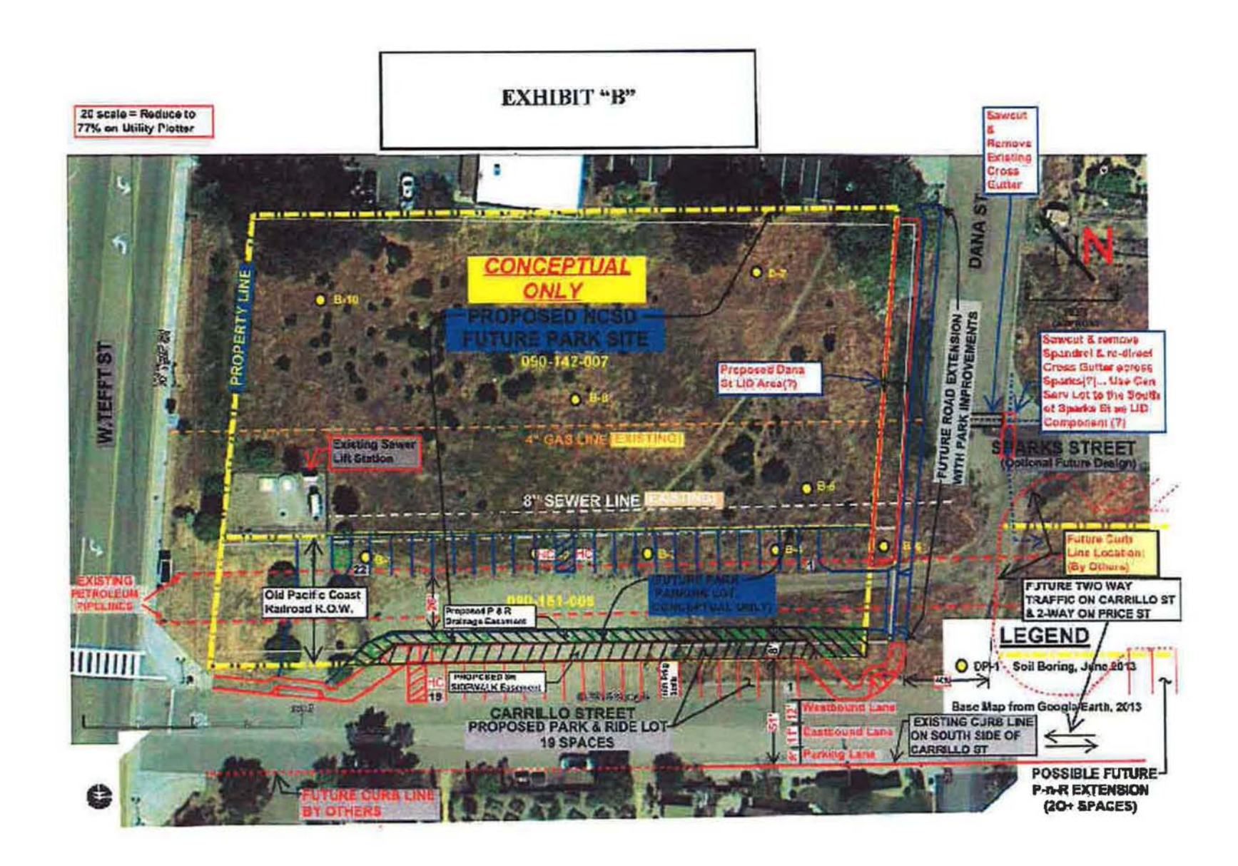
Page 14 of 14