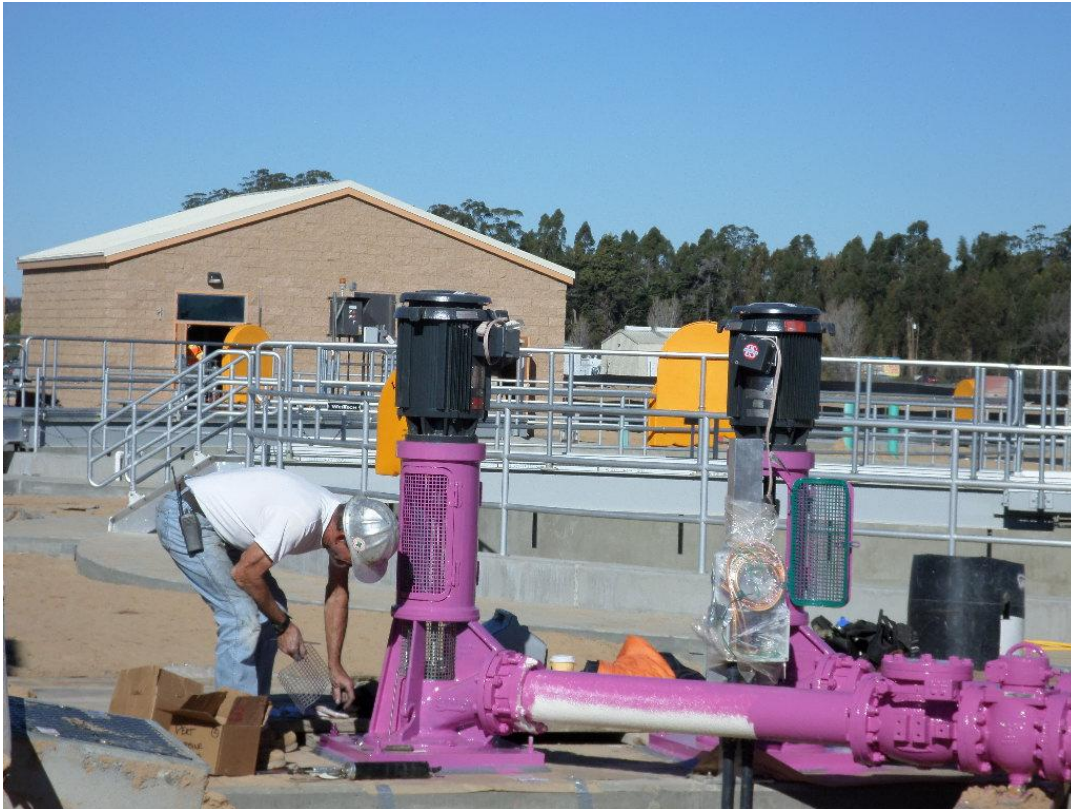
Cushman installing the Vertical Turbine Pumps.