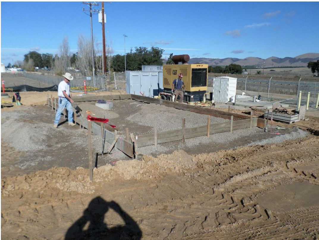
Cushman forming the truck wash down station slab.