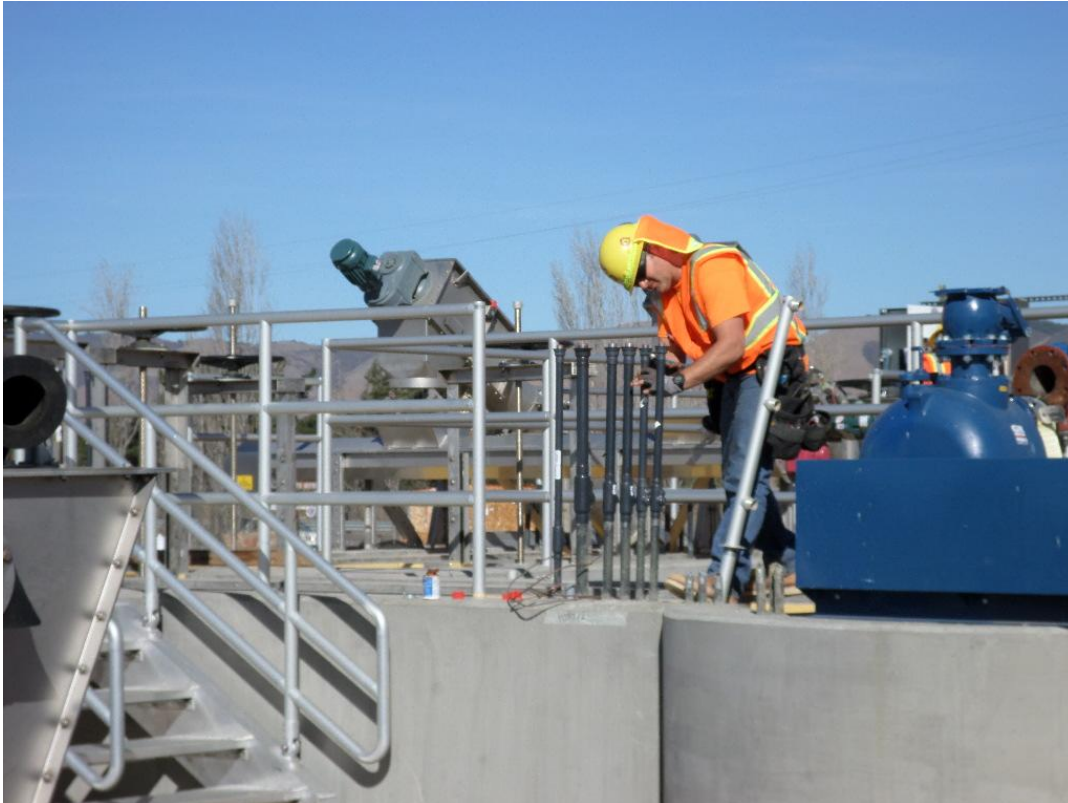
Bergelectric installing PVC coated conduit.