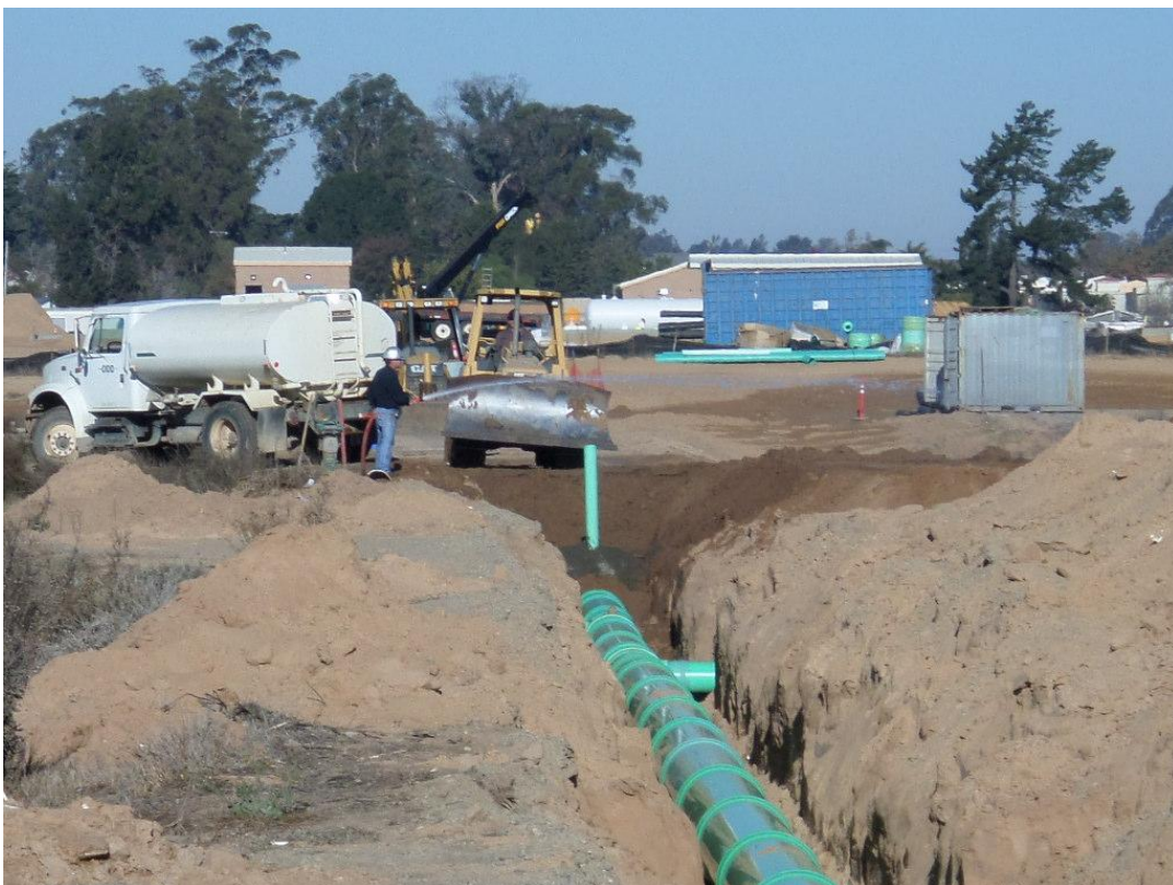
Cushman installing 24-inch SE2 piping and valves.