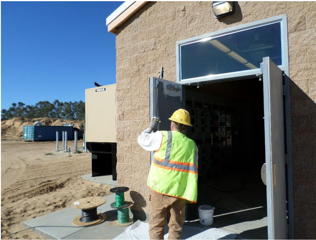
KNK Coating abrading and applying prime coat to the doors and trim.