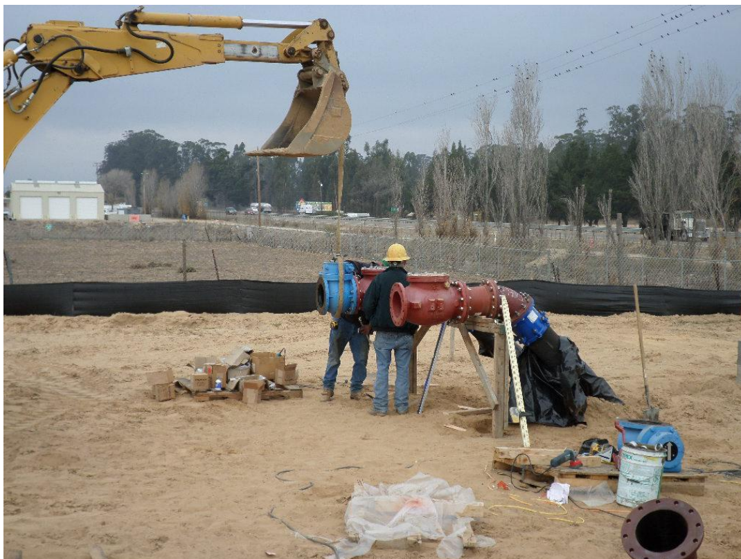
Cushman installing exposed 16-inch RW piping.