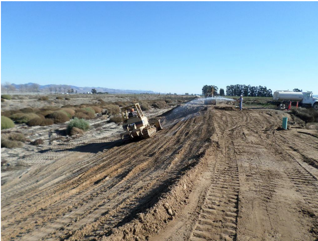
Grading at Pond #3 to rebuild pond sides after 24-inch SE2 pipe installation.