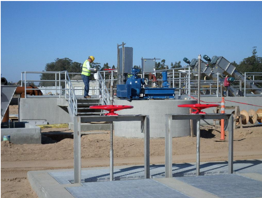
KNK Coating applying red coating to the actuators.