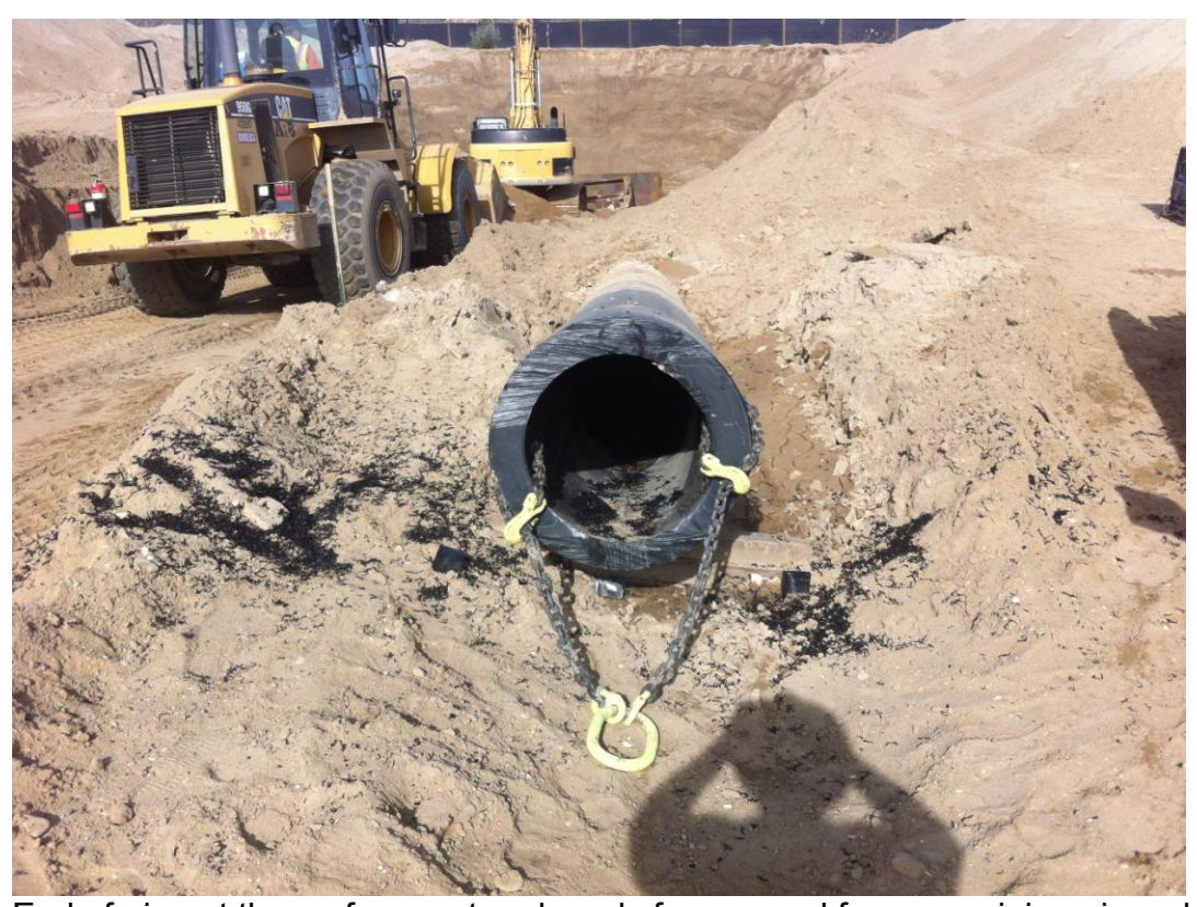
End of pipe at the surface, cut and ready for removal from remaining pipe which is at grade.