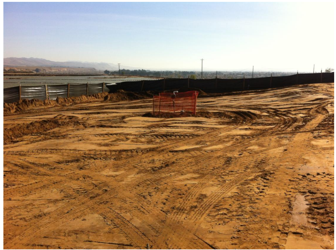
ARB demobilized, site graded and end of pipe riser protected.