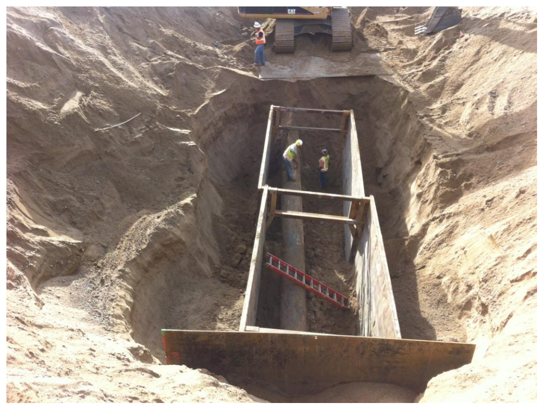
ARB continuing excavation around HDPE pipe in order to move it into horizontal and vertical alignment.