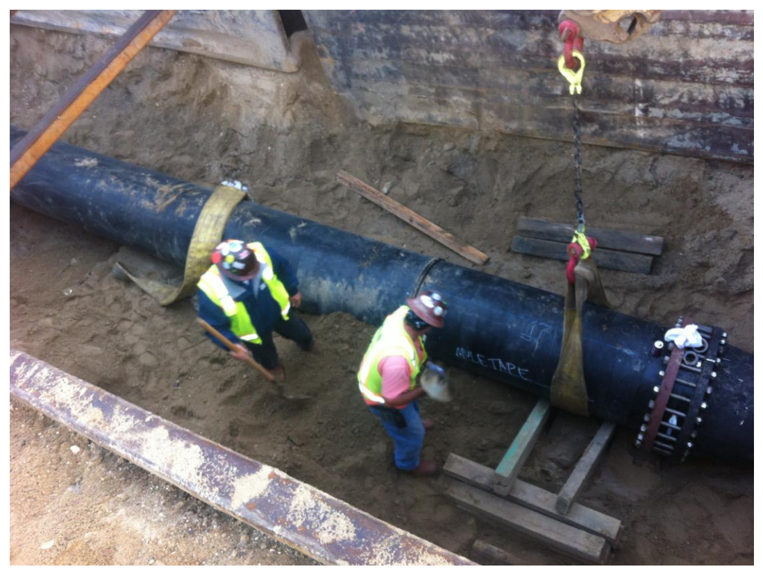
ARB shifting end of pipe to reach alignment.