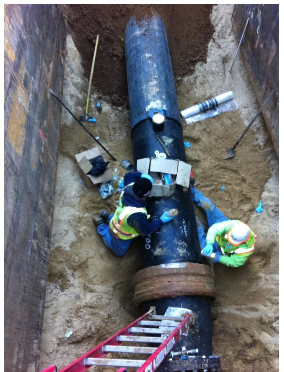
ARB placing wax tape coating on 30-inch flange around connection at reducer on end of HDPE pipe.