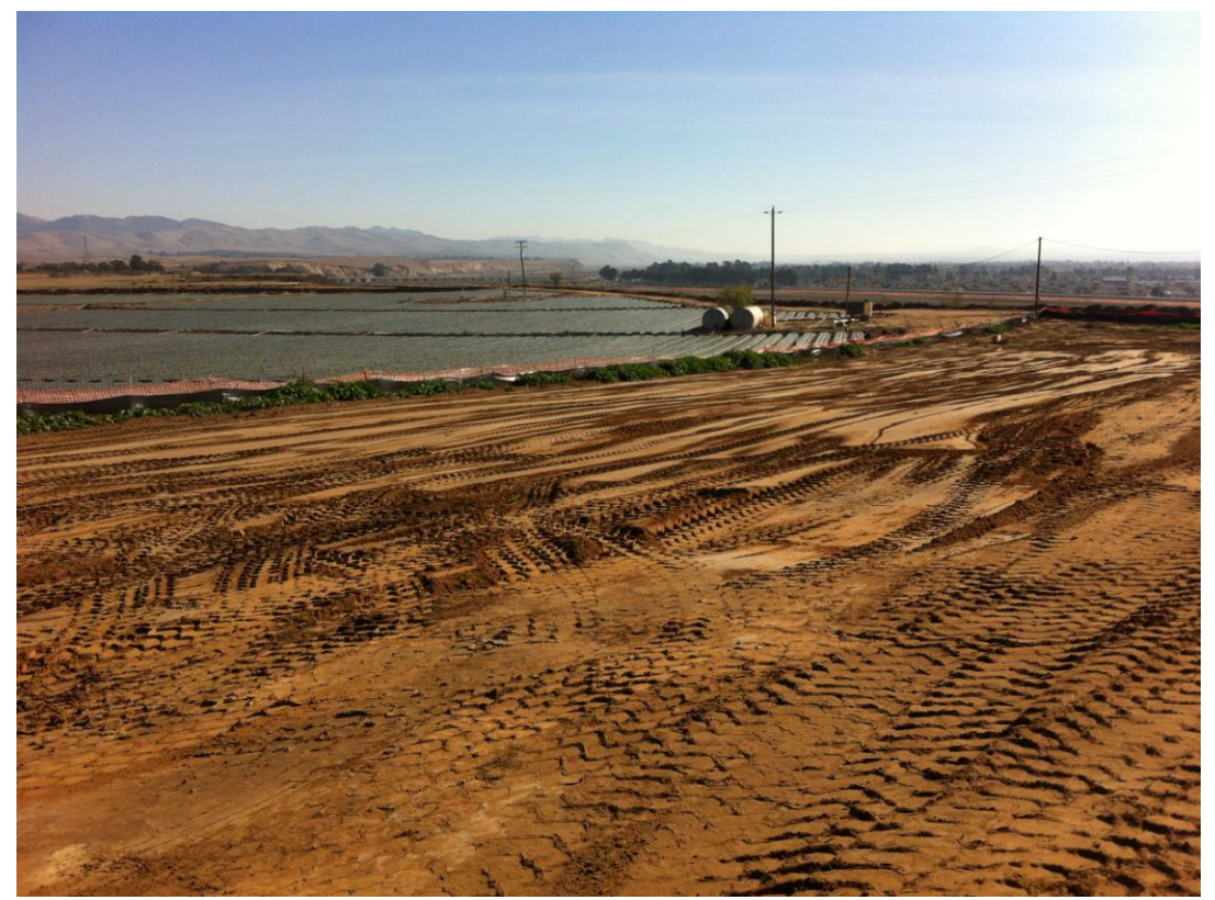
Area where sink holes occurred compacted and regraded.