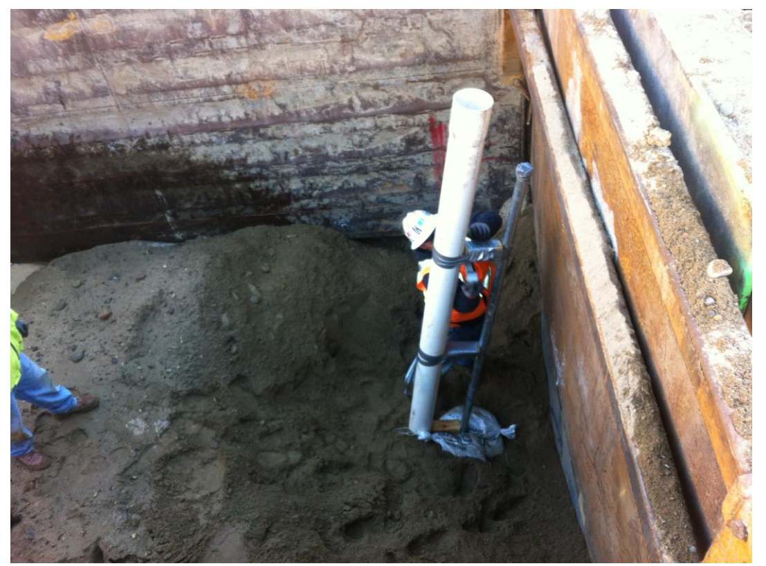
Valve can and riser with 4 X 4 struts in between for support.