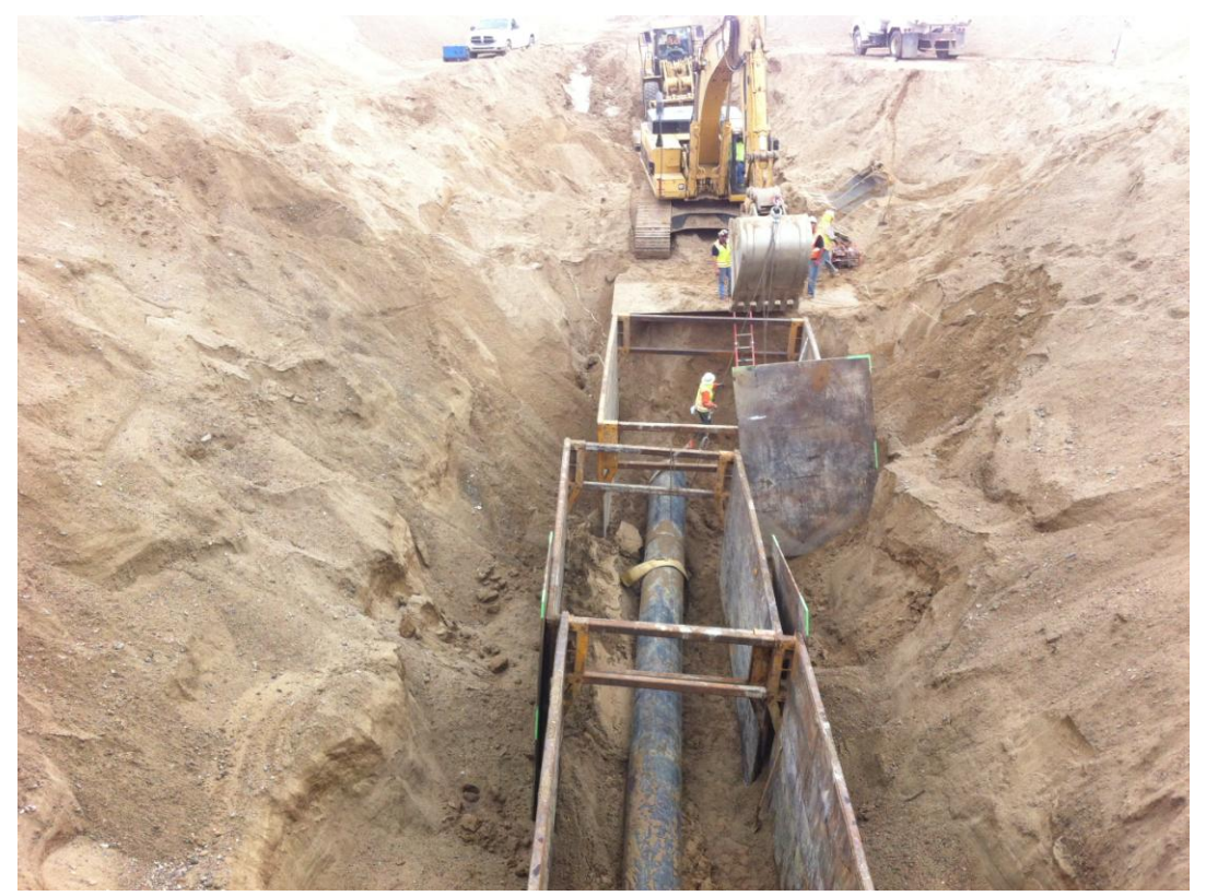
ARB continuing to place shields around pipe.