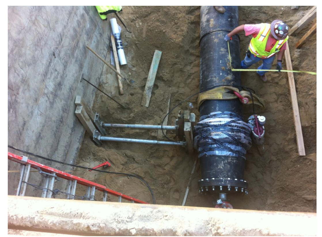
ARB and MNS making final checks of alignment in the field, before calling MNS surveyors to verify alignment and As-Built the end location.