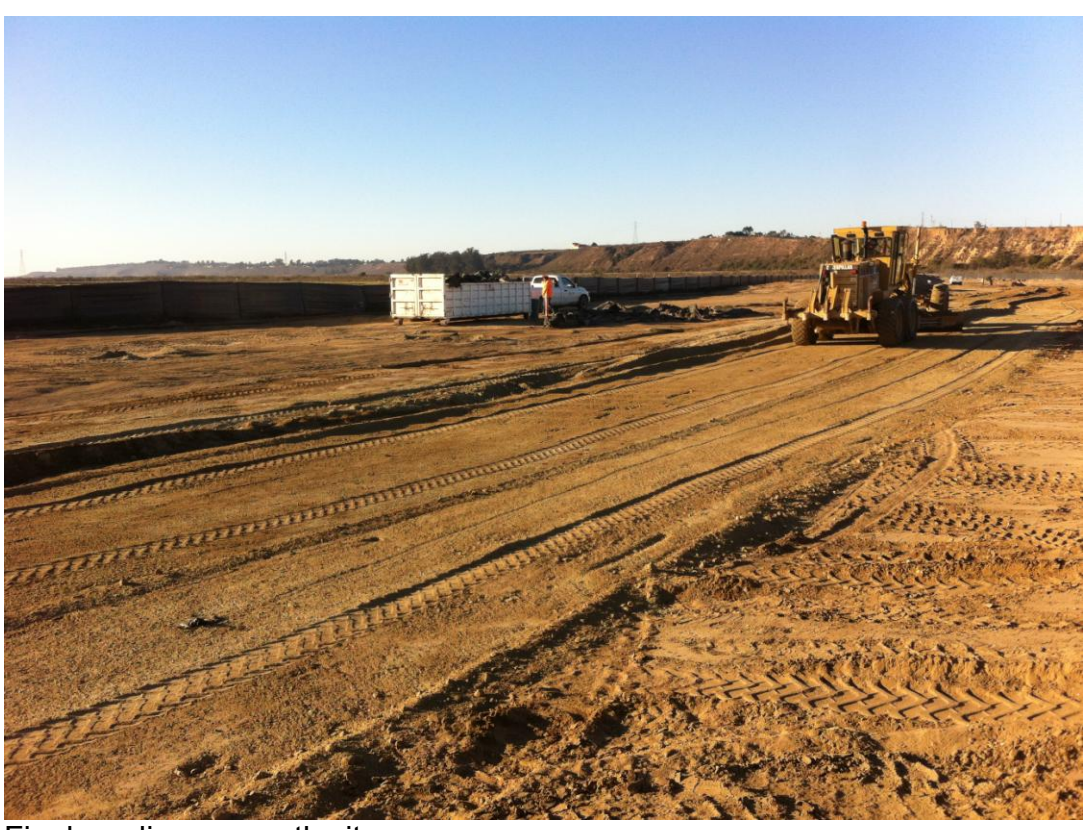
Final grading on south site.