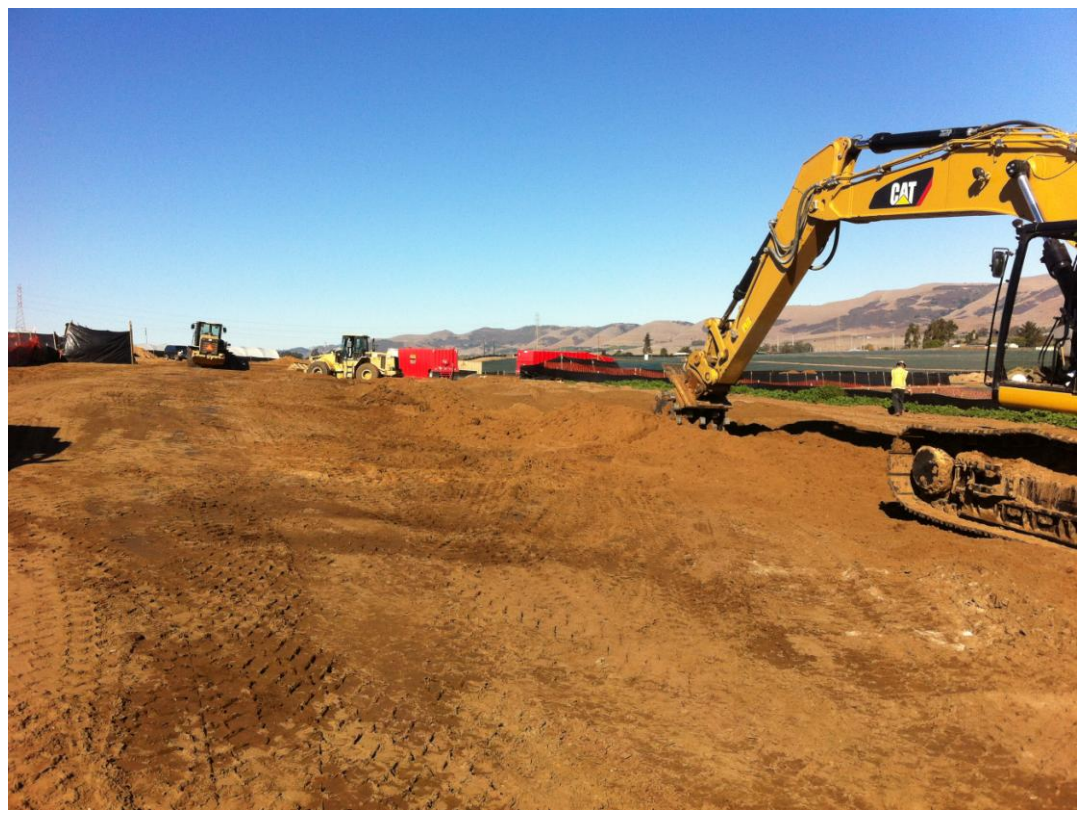
Final compaction over sink holes.