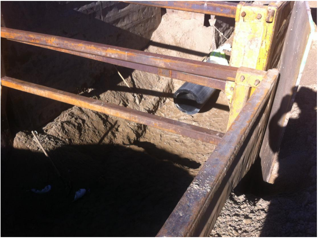
South end of HDPE pipe at grade and ready for fusing of pipe extension to put the pipe back onto the design alignment.