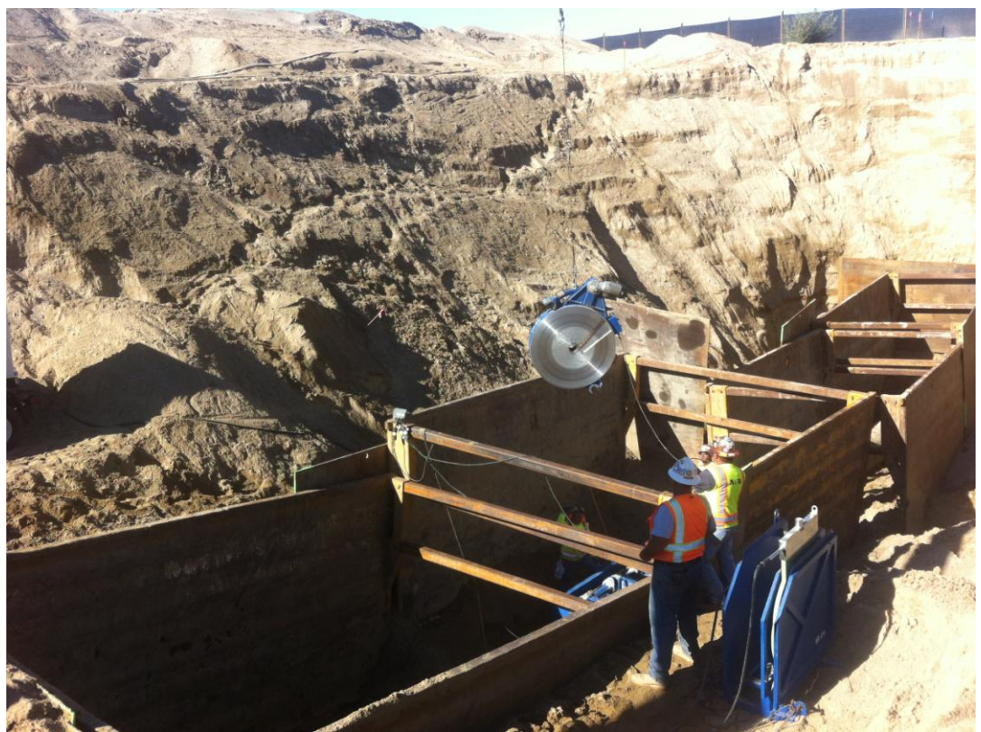
ARB lowering the pipe fusing machine into place.