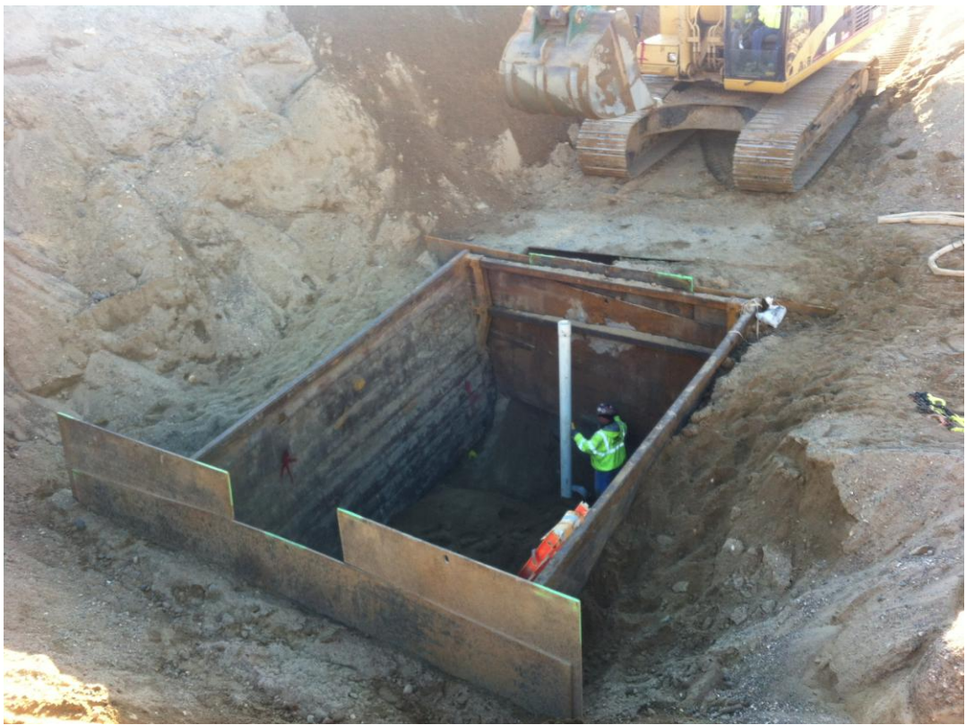
ARB installing 4-inch gate valve and riser at the end of the pipe.