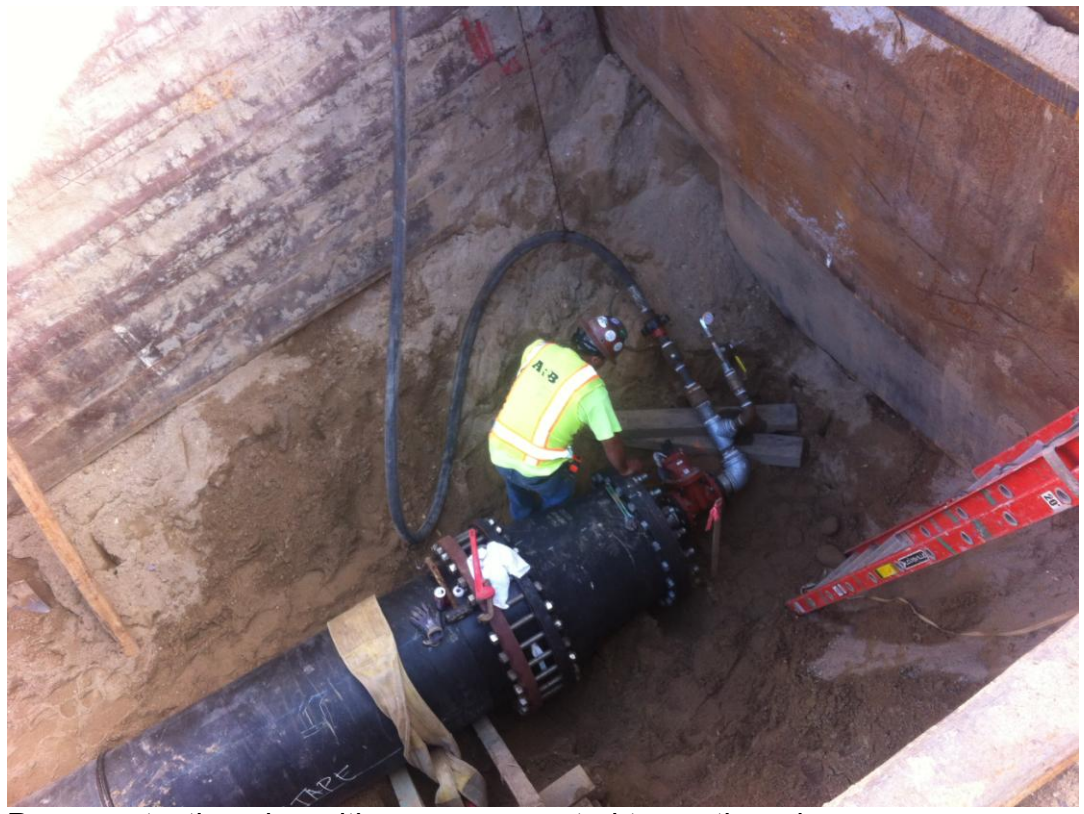
Pressure testing pipe with pump connected to south end.