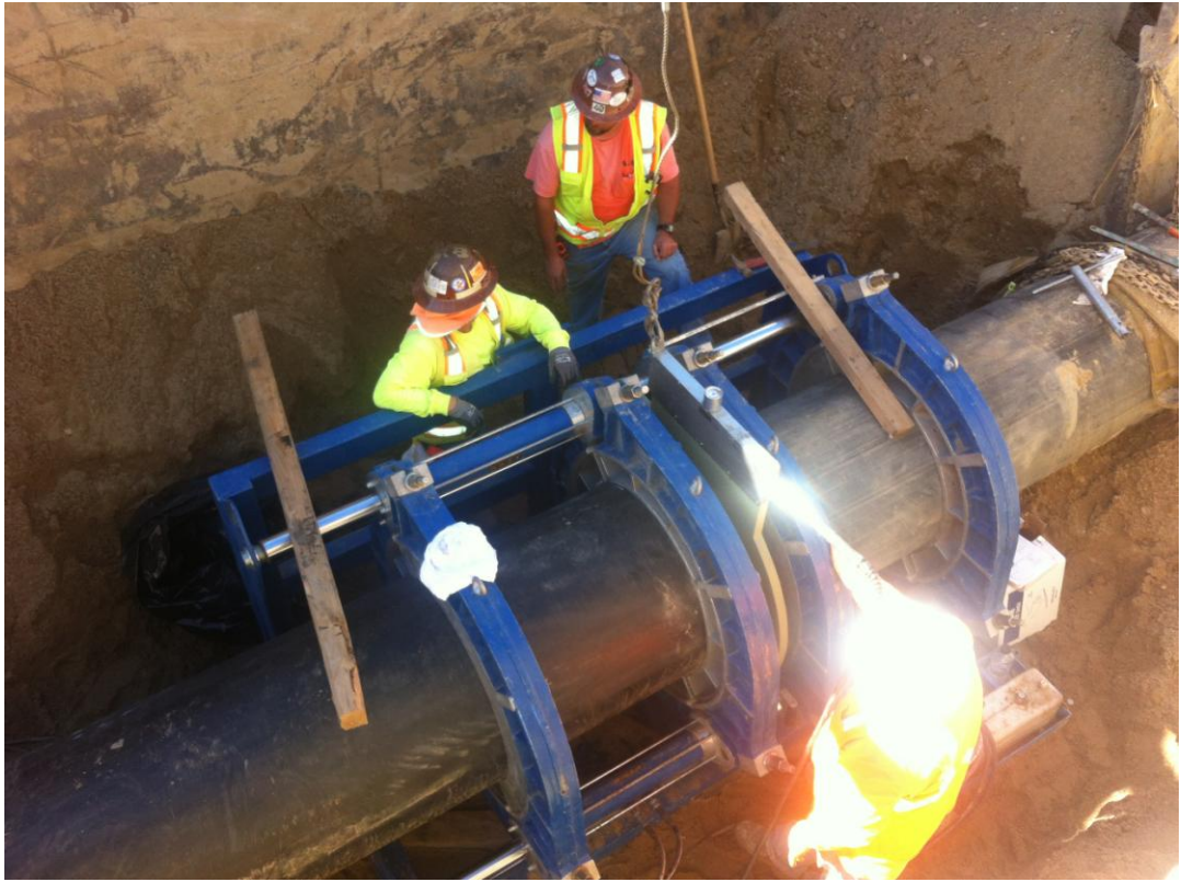
Pipe fusing machine in place with heater plate between HDPE pipe ends (reaches 472 degrees F).