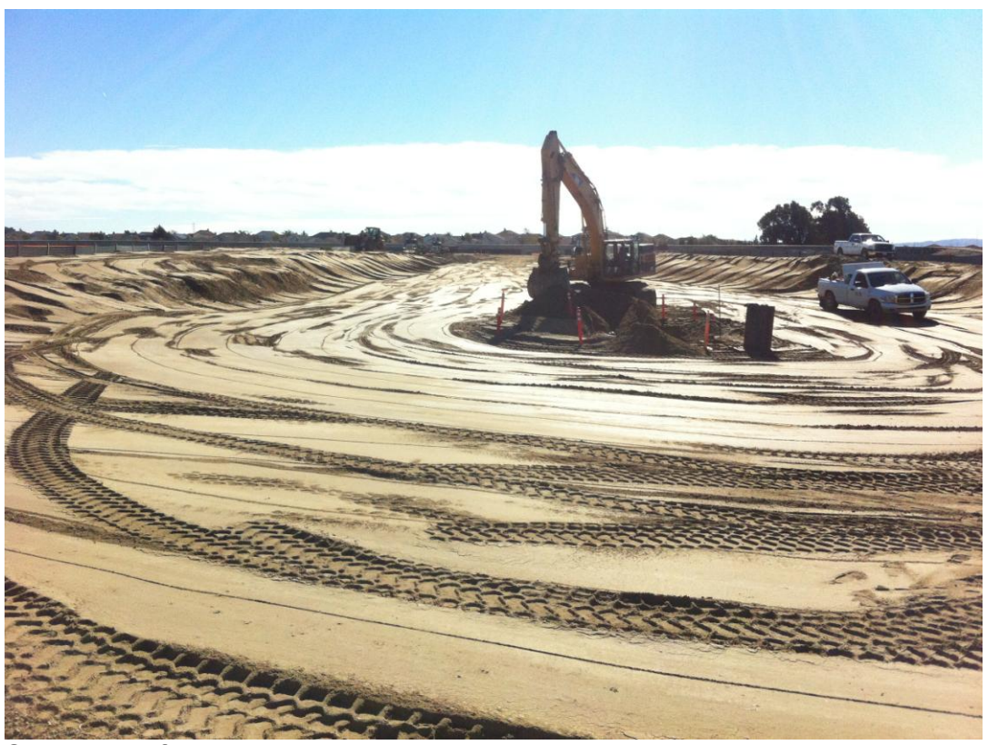
South site after demobilization. ARB continuing to complete end at riser and finish grading.