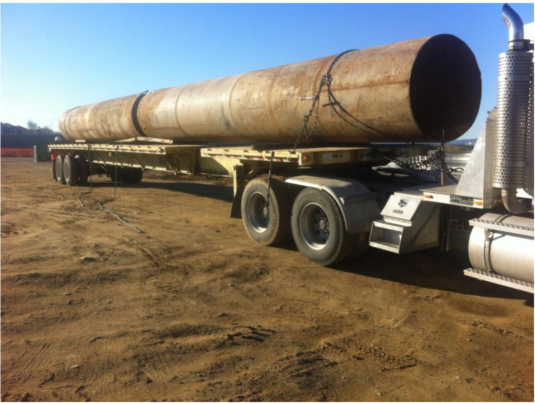
ARB removing 54-inch casing from the site.