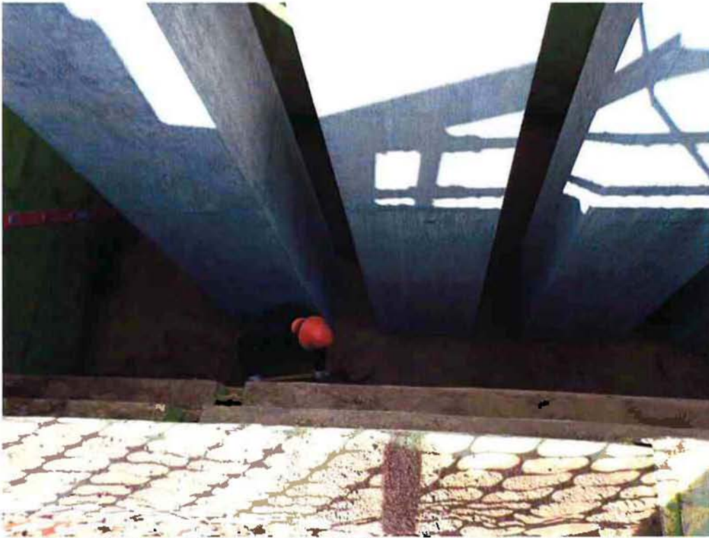
Spiess spreading native material backfill around the base of the pump cans.