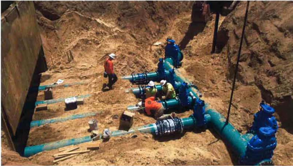
Spiess wrapping joints with wax tape and plastic on suction pipe.