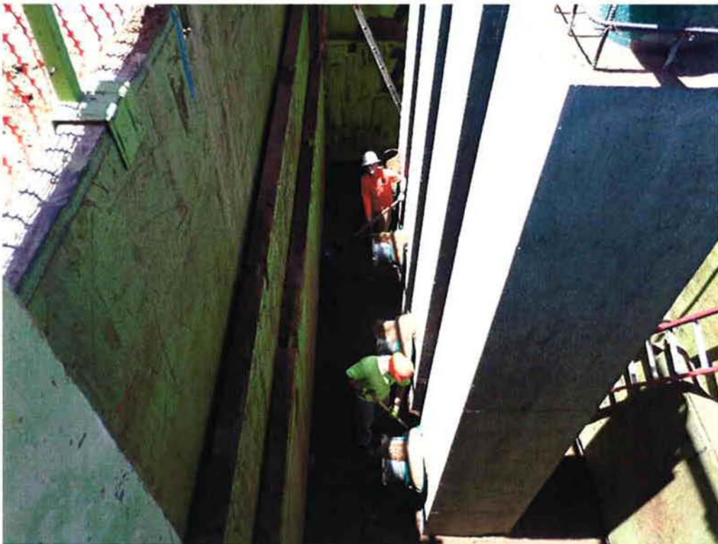
Spieß spreading native material backfill around the base of the pump cans.