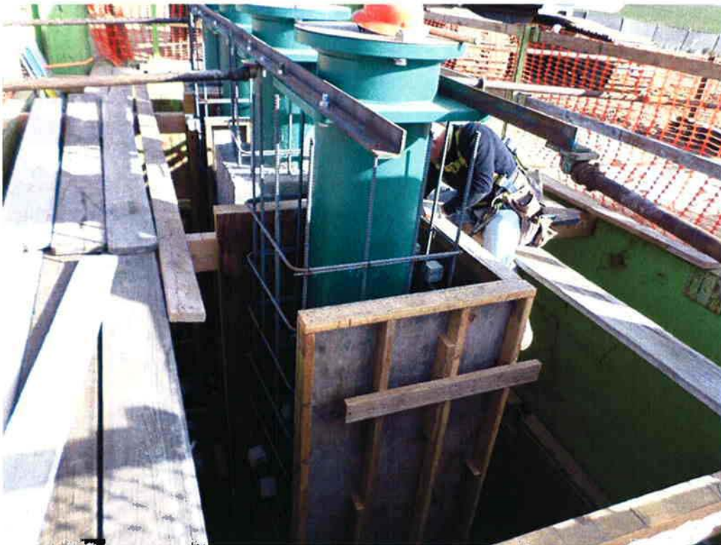
Spiess installing forms for pouring encasements at around the last two pump cans.