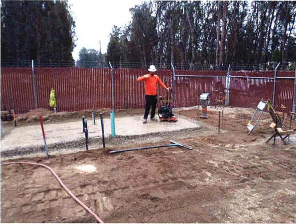
Spieß compacting base material for the Chemical Building slab.