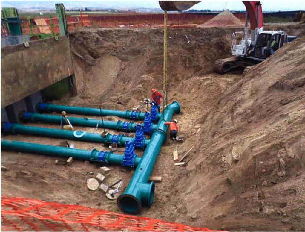
Spiess installing 24-inch manifold onto 16-inch valves.