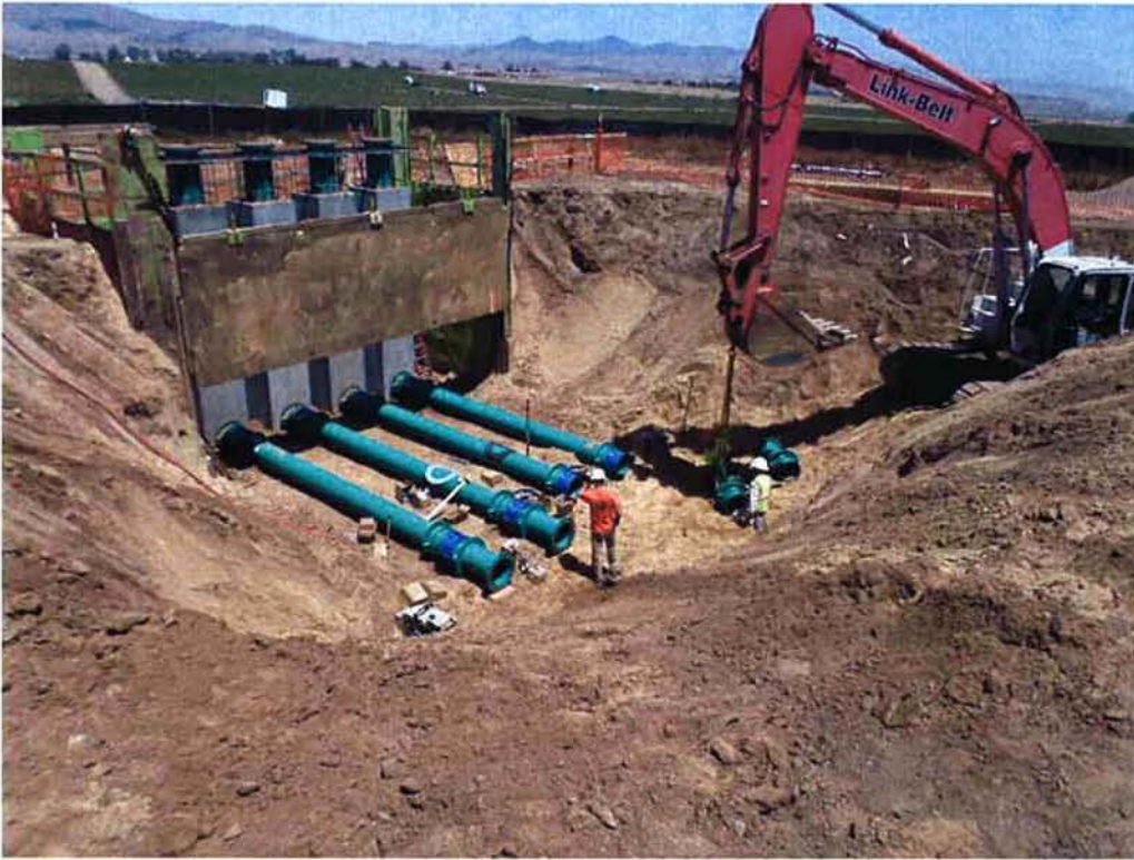
Spieß installing 16-inch coated steel suction piping and fittings.