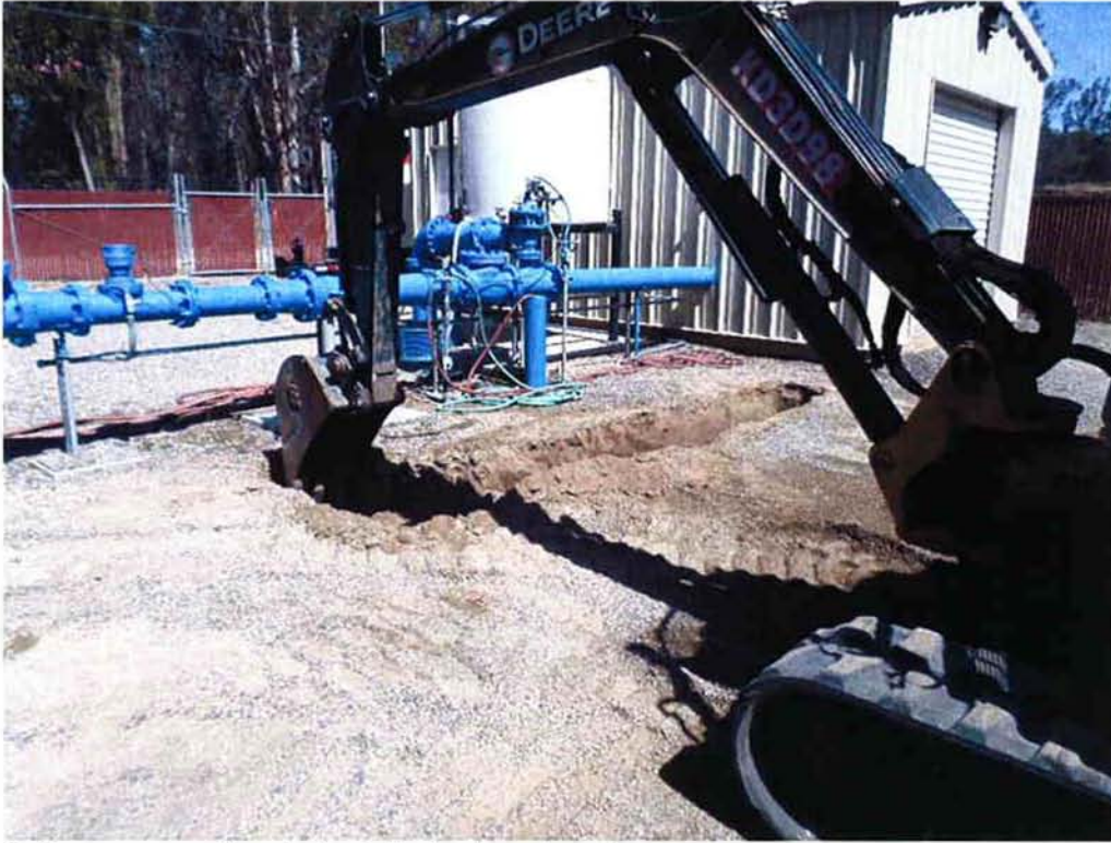
Spieß excavating to install plant water pipe.