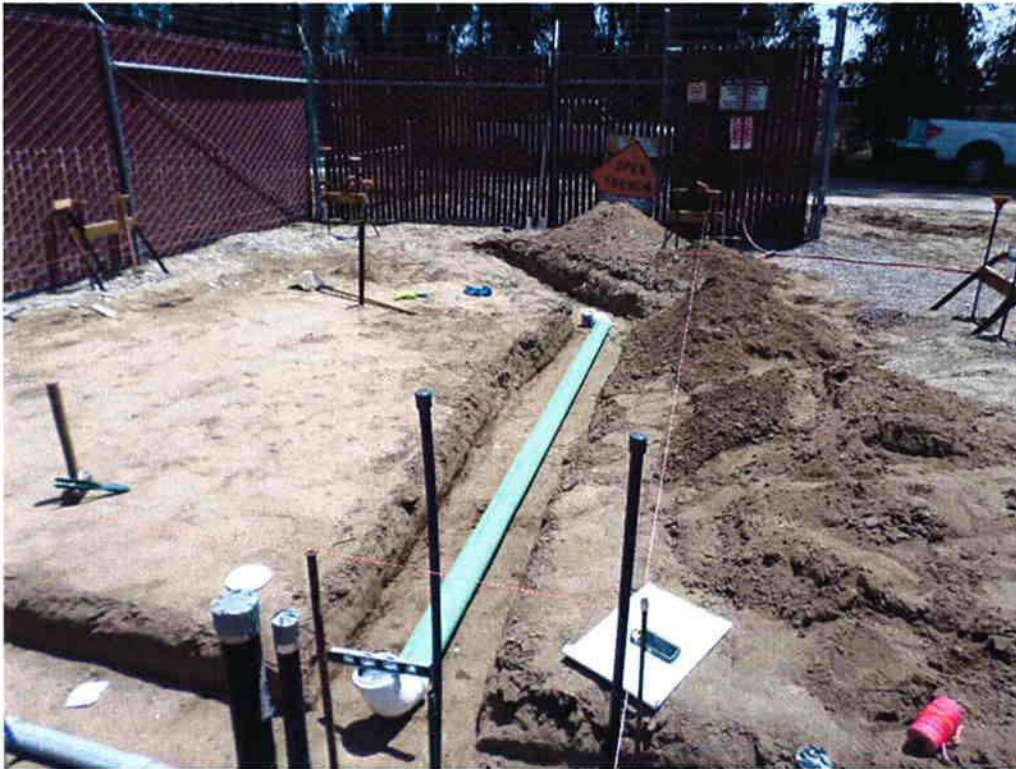
Spieß installing 4-inch PVC drain piping under the Chemical Building slab.