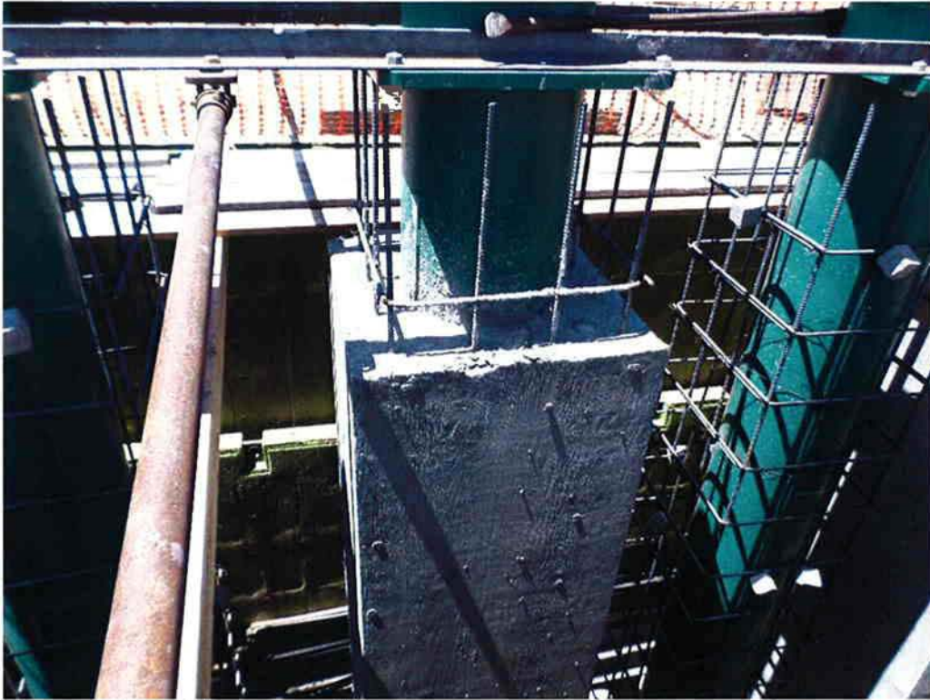
Forms stripped from around first encasement pour at pump cans.