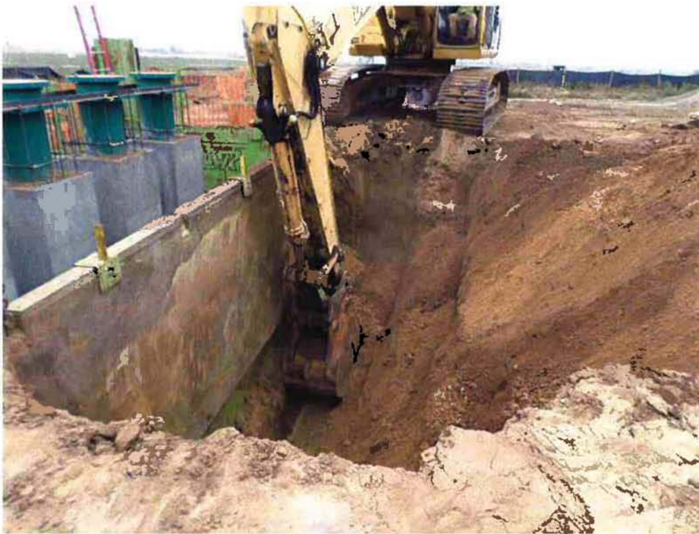
Spiess excavating and cutting back sides for installation of the suction piping and manifold.