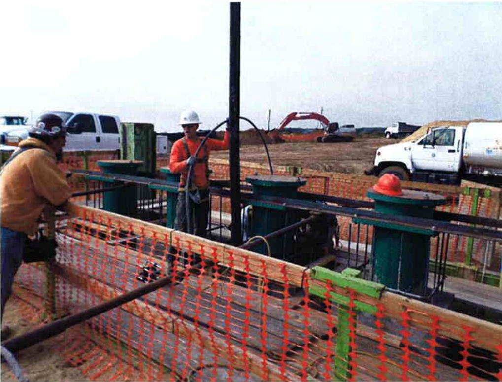
Spies pouring last two pump can encasements.