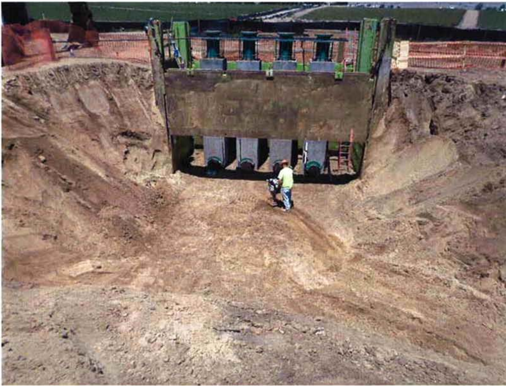
Compacting subgrade under future suction piping.