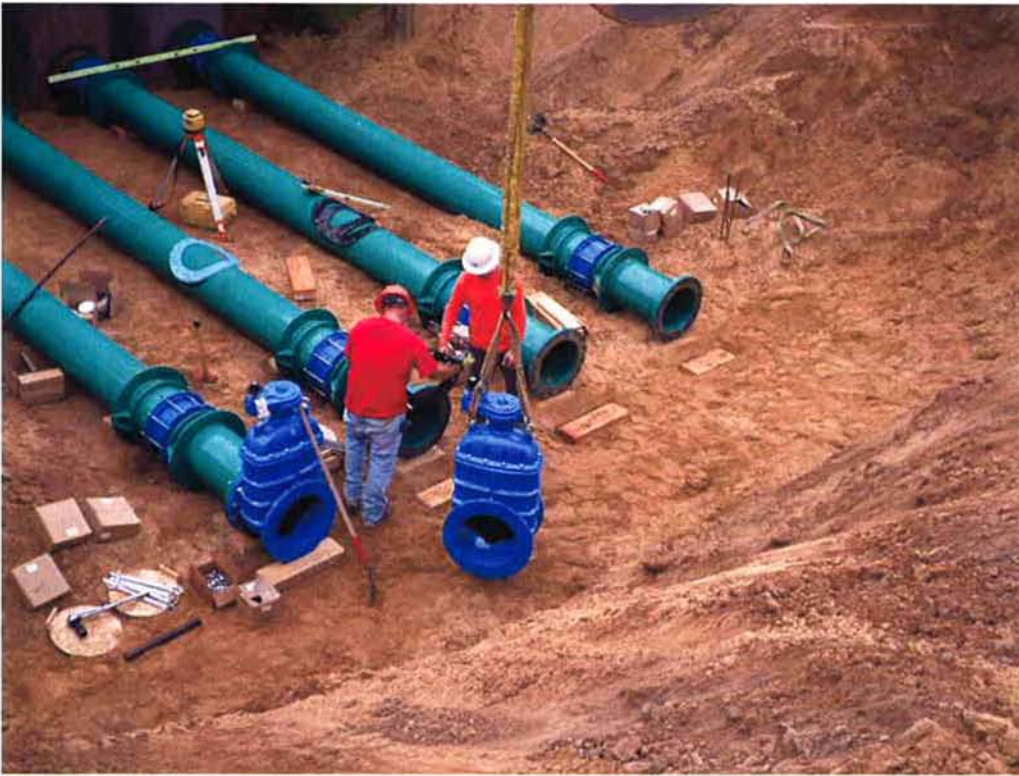
Spieß installing 16-inch valves.