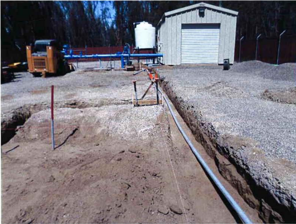
Spieß installing 2-inch PVC conduit for chemical tubing.