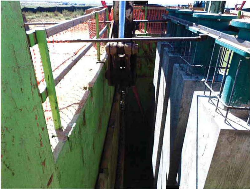
Spieß raising slip shoring from around the pump cans with the excavator.