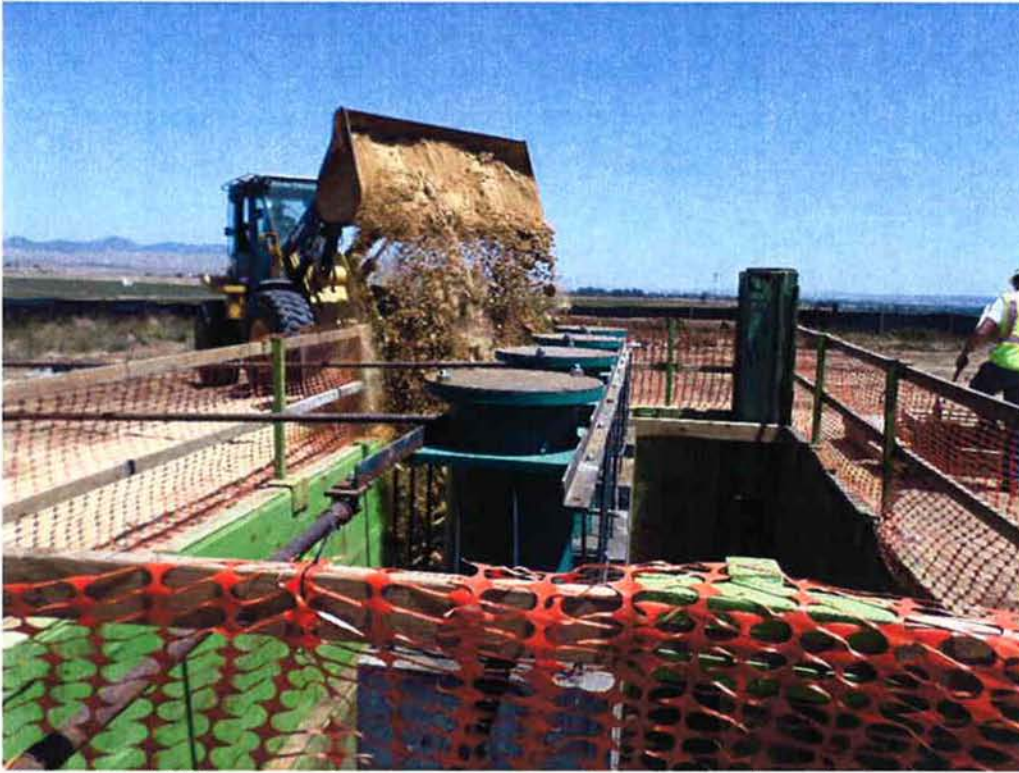
Spiess backfilling around concrete encased pump cans in order to remove some of the shoring before work on the suction pipes.