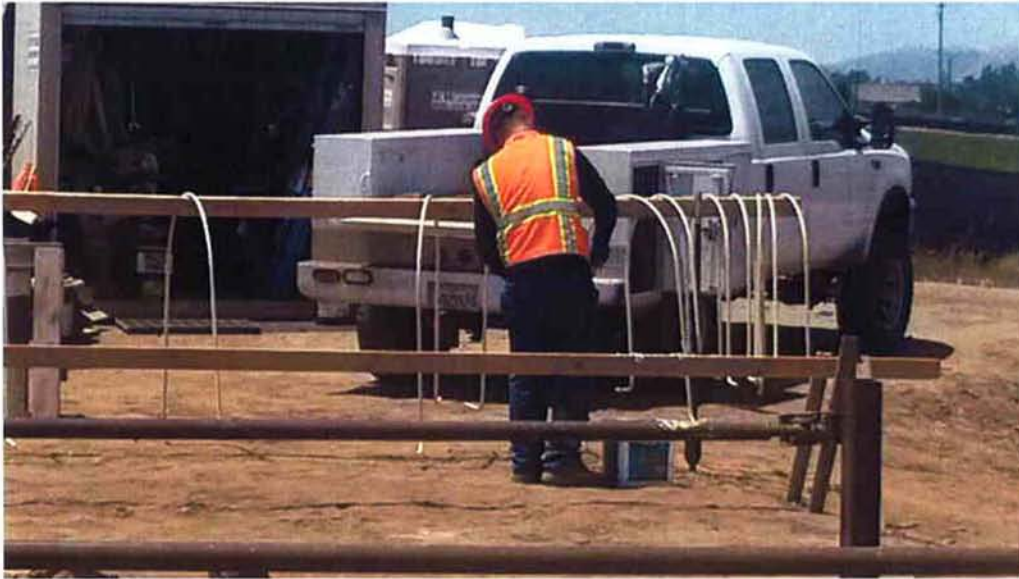
Spiess coating rebar for valve anchors.