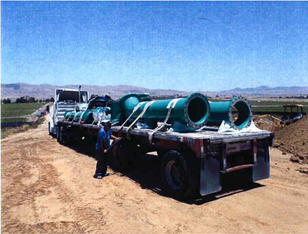
Spieß taking delivery of more coated steel pipe.