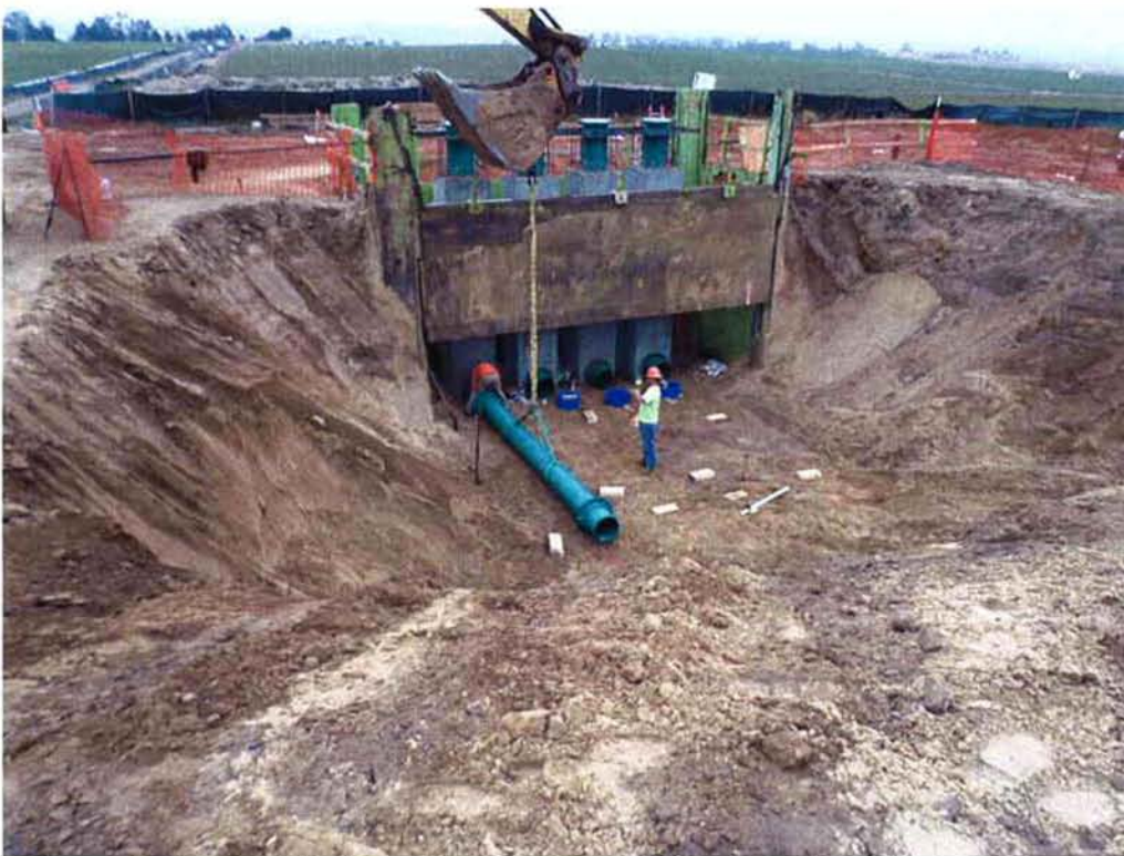
Spieß starting installation of 16-inch coated steel suction piping.