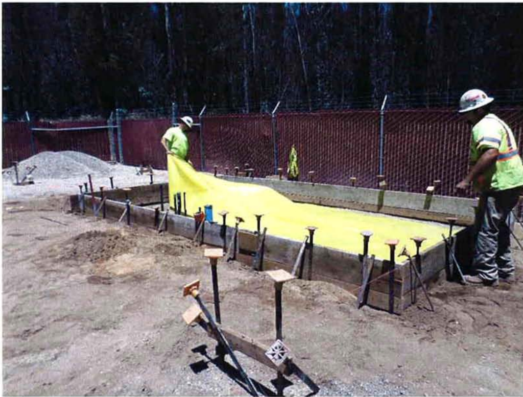
Spieß placing underslab vapor barrier at Chemical Building slab.