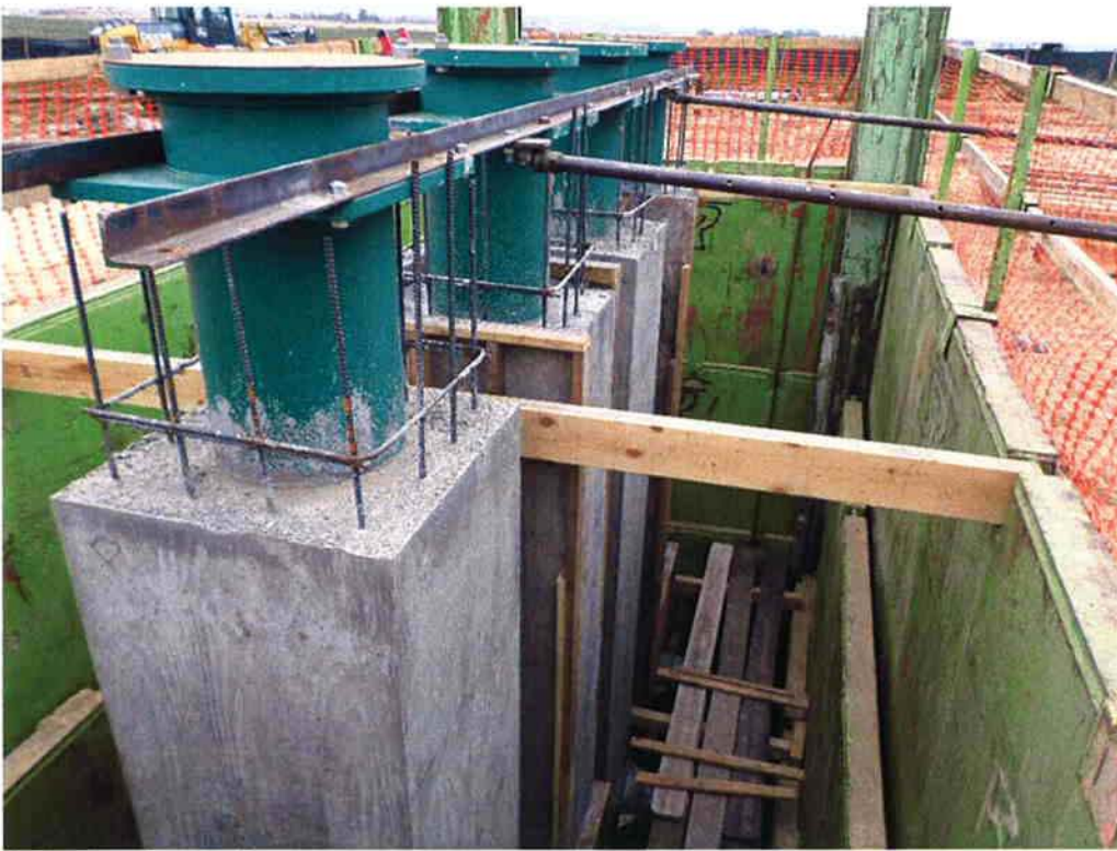
Stripping forms from second pump can encasement pour.