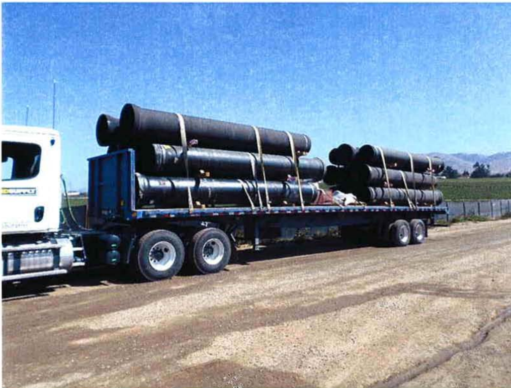
Delivery of 24-inch ductile iron pipe.