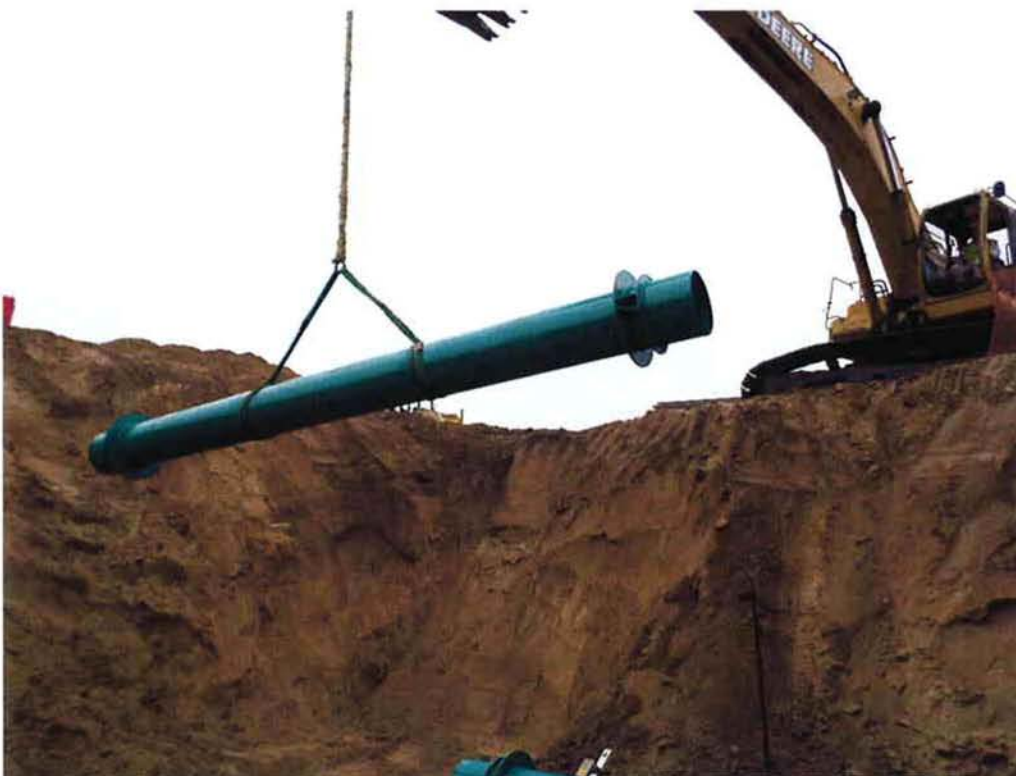
Installing suction piping.