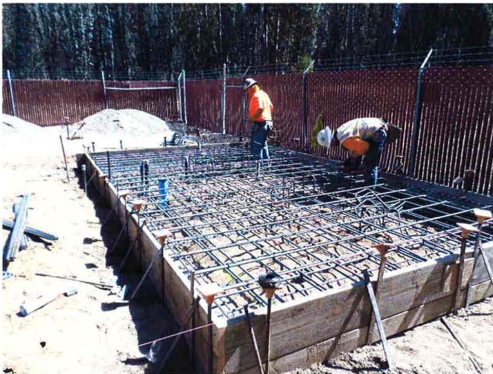
Vista Steel installing reinforcing at Chemical Building.