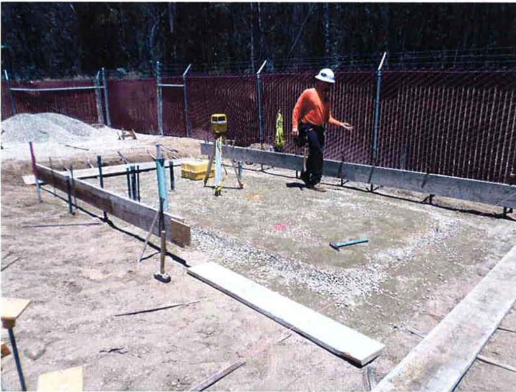
Spieß installing forms for the Chemical Building slab.