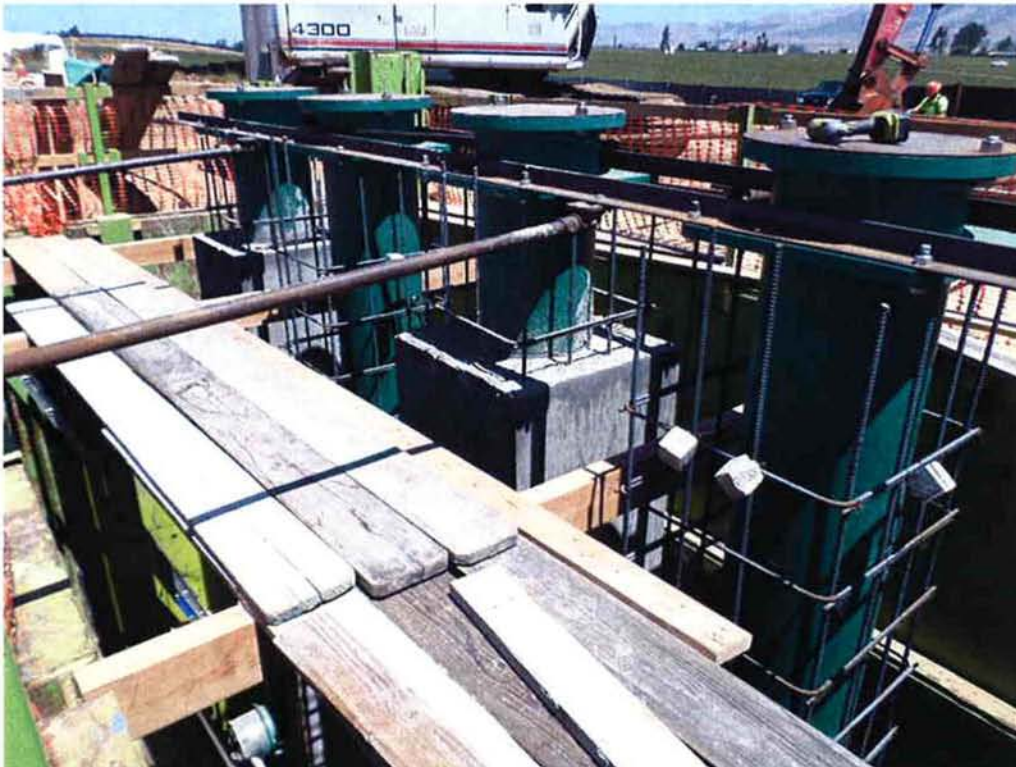
Stripping forms after first pour of encasements around pump cans.