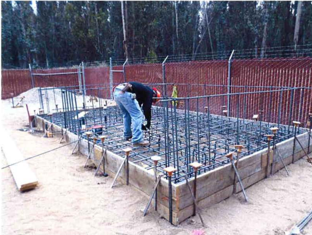
Vista Steel finishing installation of reinforcement at Chemical Building slab.