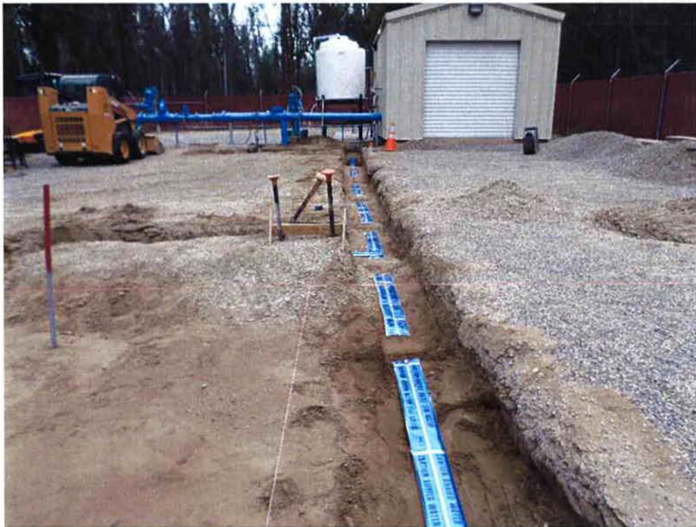
Spieß backfilling and placing tape over chemical tubing pipe.