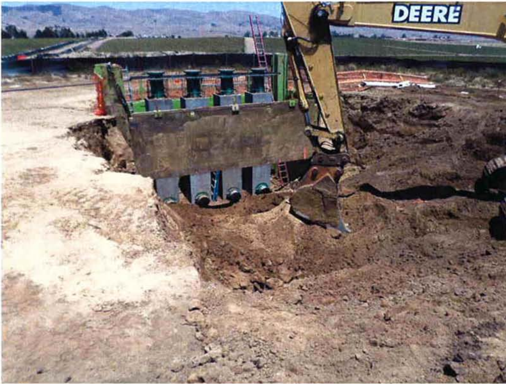
Spies continuing work on the open cut for installation of the suction pipe and manifold.