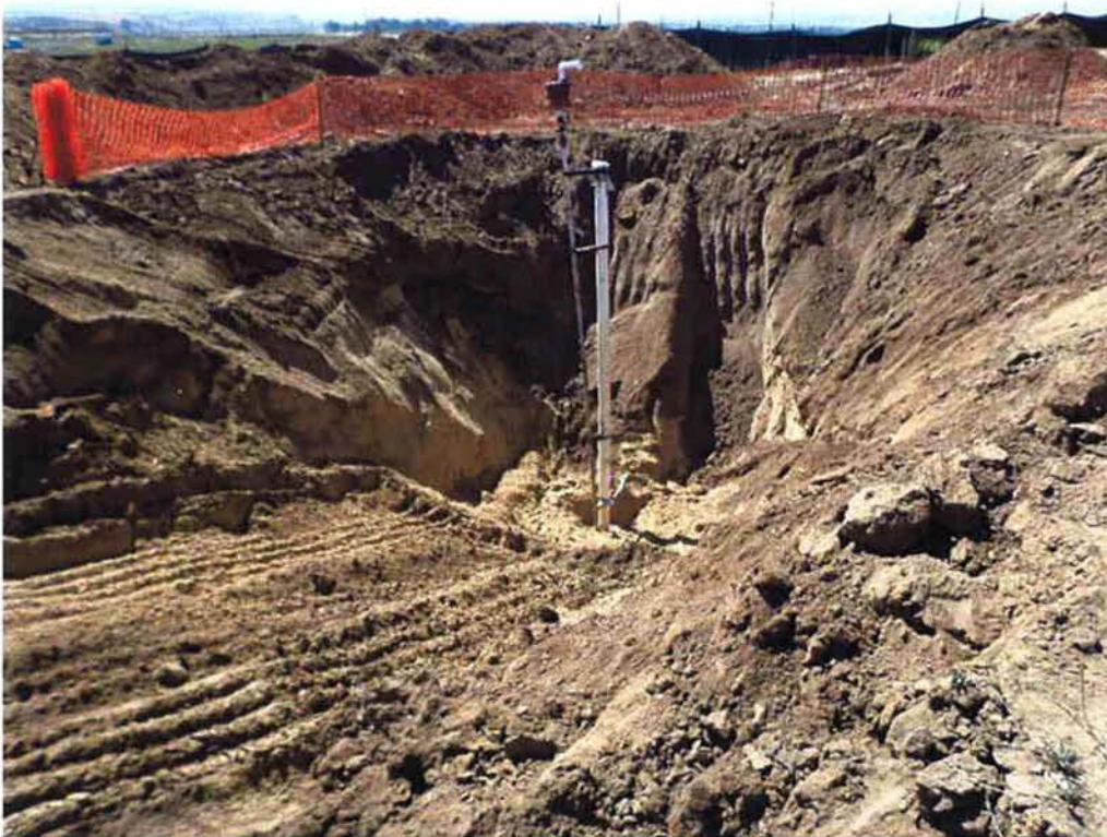
Spiess working on excavation to connect to the Bid Package #1 pipe.