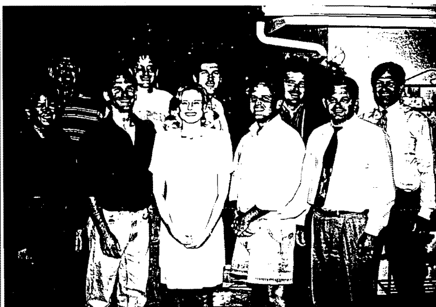
1996-1997 SAN LUIS OBISPO/CENTRAL COAST BRANCH OFFICERS

Engineers were faced with the challenge of improving the existing water system of San Miguel to meet fire protection standards and Title 22 standards for quality, quantity, reliability and operation. This task was complicated by a small customer base unable to absorb the entire cost of a new system. By pursuing all available funding sources and using innovative design features, system improvements were implemented and water rates were actually reduced by as much as 39%.