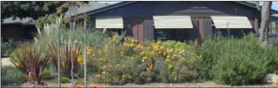
Streetside section of the Goleta Water District Demonstration Garden

The following is a list of the public demonstration gardens in Santa Barbara County that provide living examples of resource efficient landscaping.