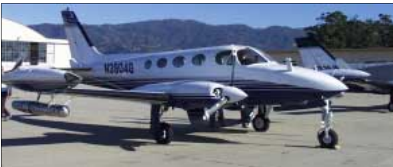
Aerial seeding utilizes silver iodide generators mounted on airplane wing tips

Local aircraft generators are flown on planes leaving the Santa Barbara or Santa Maria Airports. This is a more precise method of seeding because the pilot can fly directly into precipitation bands, the most productive portions of the storm. These bands can be detected by radar and pilots can be directed to them by radio. Ground generators are located at the Refugio Pass and La Cumbre Peak in the Santa Ynez Mountains, and are independently activated by a meteorologist from the control center. A com-