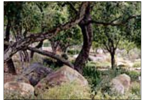
Firescape, Santa Barbara

Located across the street from Fire Station #7, this 1.7-acre labeled garden demonstrates how risks of wildfire can be reduced through appropriate planting of low-water using plants, irrigation, and management. Open 8:00 a.m. to sunset every day. Admission is free.