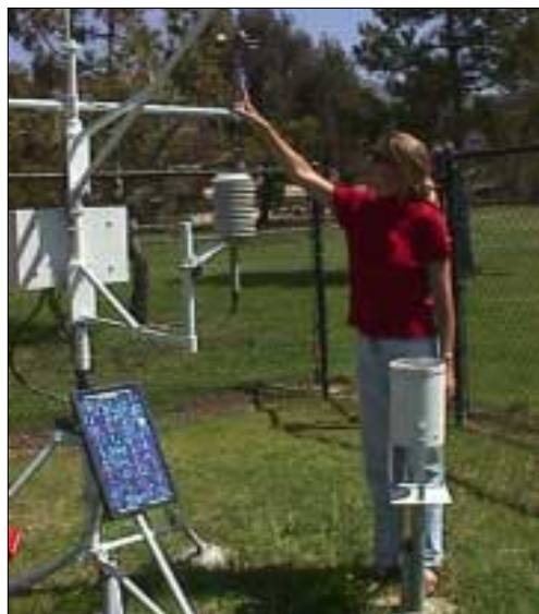
A CIMIS station in operation

The California Department of Water Resources (DWR) holds semiannual meetings for water purveyors and educators in California. SBCWA staff participates in these meetings, which facilitate the exchange of information and ideas regarding water education.