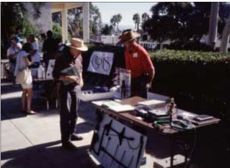
South Coast Sustainable Landscape Fair

The Santa Barbara County Water Agency (SBCWA) operates the Regional Water Efficiency Program to assist water purveyors and residents. Though the SBCWA does not sell water, it supports a variety of programs that are effective when administered at the County level in cooperation with individual water districts. These regional programs include: