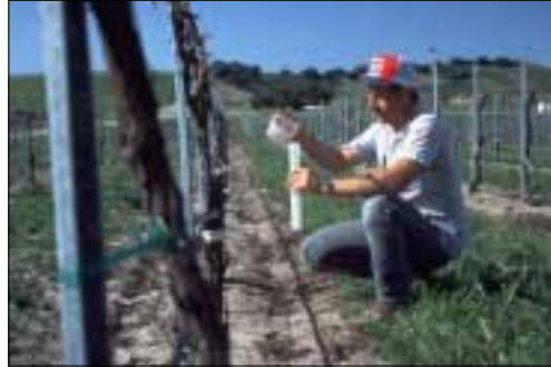
Mobile lab irrigation evaluation

The objectives of the Irrigation Water Management Program are to conserve water and energy in Santa Barbara County. This is accomplished through the implementation of Best Management Practices (BMPs) for operating and maintaining agricultural irrigation systems. Staff from the Cachuma Resources Conservation District (CRCD) provides irrigation system evaluations to local agricultural water users to help implement the BMPs. The CRCD manages the Mobile Irrigation Lab, which travels to the site to be evaluated. As part of the evaluation CRCD staff analyzes the Distribution Uniformity of the sprinklers; provides an estimate of seasonal evapotranspiration, effective rainfall, leaching and irrigation water requirements; tests pump-