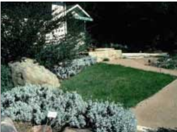
Santa Barbara Botanic Garden's Home Demonstration Garden

The Lifescape Garden features a variety of low-water using and edible plants, as well as composting systems and efficient irrigation. Chumash Point emphasizes native plants from the range of the Chumash Indians. These plants have medicinal, nutritional and spiritual importance to the Chumash. Open sunrise to sunset every day. Admission is free.