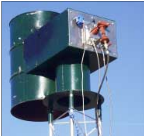
Silver iodide generators placed on mountaintops release condensation nuclei into passing clouds

The current cloud seeding program in Santa Barbara County uses state-of-the-art technology to reduce the associated risks of excessive rainfall or rainfall occurring in areas not intended. County hydrologists use a network of rain and stream flow gages together with predictive computer models to prevent potential problems. A set of suspension criteria is established every year which specifies conditions under which seeding may be conducted. For example, all seeding is suspended in the areas recently burned by wildfires (such as the Marre Fire in Santa Ynez Valley) because those areas are sensitive to excessive soil erosion which can lead to landslides and downstream sedimentation. Seeding can resume when geologists and others have determined that there is no longer any danger of